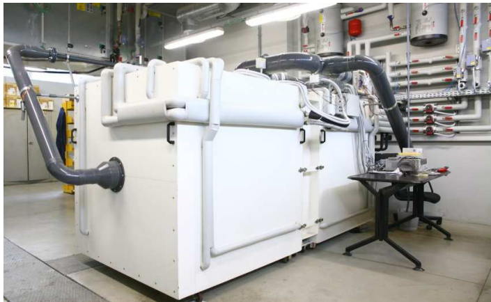
Fig. 1: picture of the DAVTB apparatus. Chambers, sample frame and part of the air plant are visible in the foreground. The external section of the secondary plant is in the background.

The experimental set-up under discussion (Fig. 1) is mainly composed by two insulated chambers divided by the sample and connected by the ventilation system. Temperature can be controlled in each chamber separately, through a heating and cooling plant, and the air flow can be controlled both in velocity and direction.