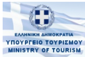
Ministry of Tourism