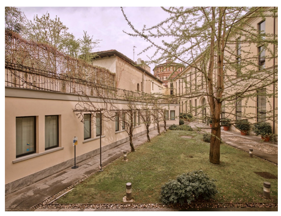
Figure 8. The complex articulation of WeMi Stelline.

functions that was made possible by the strong versatile use of spaces managed through light tools and interventions: "Hug-WeMi is a cafeteria and a space for cultural events at the same time. All you need is to move the curtains. Also, we organise workshops and meetings on carerelated issues, such as parenthood and disability" (social operator of WeMi Venini).