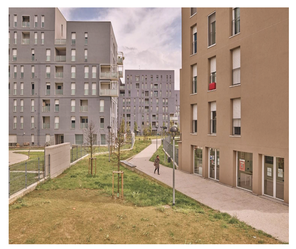
Figure 6. The ground floor spaces of WeMi Voltri (on the right) inside the social housing estate of Via Voltri-Via di Rudini, Milan.

workers inside this space showed that these recreational activities were the occasion for the non-profit firm to establish a relationship with the inhabitants and their needs, and to direct them to other services provided by