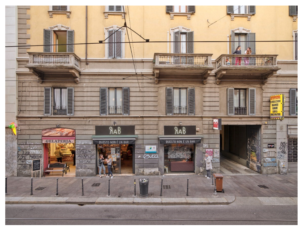
Figure 2. RAB-WeMi San Gottardo, streetscape.