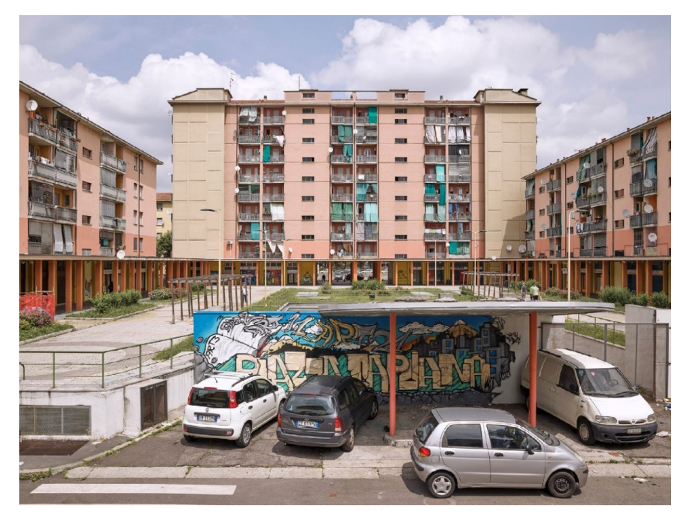
Figure 4. The square of WeMi Capuana.

WeMi Voltri was created inside an informative point managed by a non-profit firm in a new, quite large social housing estate. Both orientation desks were opened within the framework of different projects funded by Fondazione Cariplo, and they now interact to cater to the needs of different people. This space is located on the ground floor (Figure 6), easily accessible from the