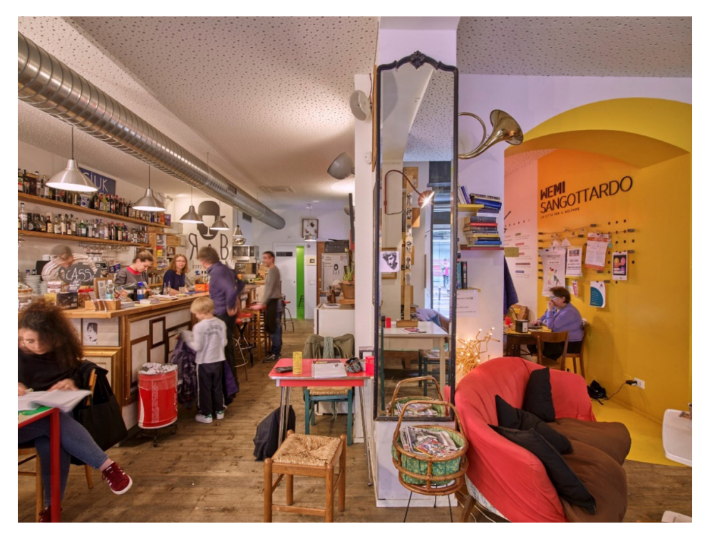
Figure 3. RAB-WeMi San Gottardo, view of the interiors.

meetings over the phone or in person, the site visit allowed us to appreciate how the location of the space was particularly important. Open to all citizens, it required walking through the entire length of the structure in order to reach it; this contributed to bringing the city inside the structure and letting citizens get in touch with some of the activities of the residents (Figure 5).