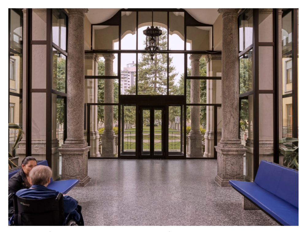
Figure 5. The entrance hall of WeMi Trivulzio.

street. Besides the orientation desks, the space is available for different activities dedicated to and developed by the neighbourhood's residents (e.g., gym courses, parent meetings, etc.). The interviews conducted with social