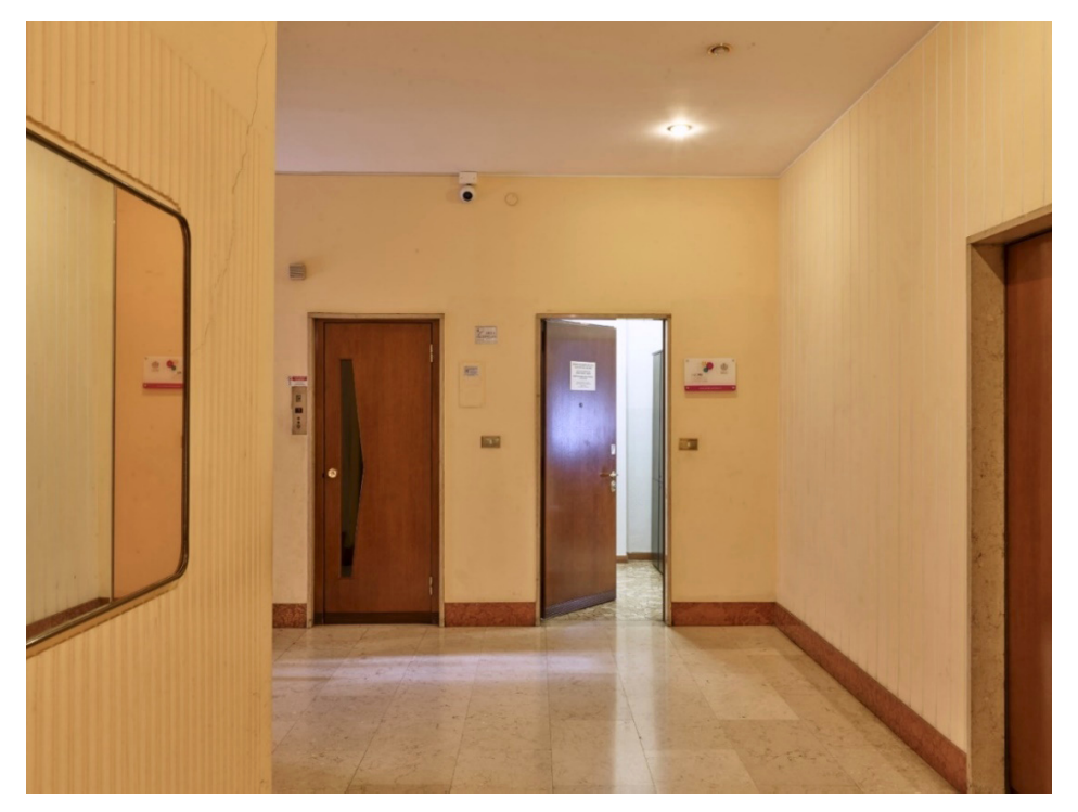
Figure 7. The residential building of WeMi Loreto.

Finally, WeMi Venini resembled the organisational model traced by WeMi San Gottardo, as it was located inside a multifunctional and fancy "hub" called HugMilano that opened in 2017 inside a former chocolate factory and hosted a bar, a co-working area, a bicycle repair shop, and a small stage for events. A complex co-existence of