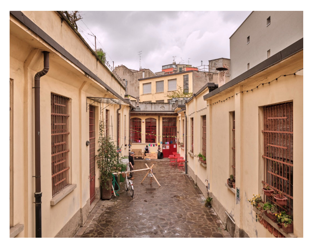
Figure 9. The courtyard whit the entrance of WeMi Venini/Hug Milano.

The place was not facing the street but was in an internal courtyard. The WeMi services were provided by an external social cooperative in an area near the entrance and a more private spot. In the course of our observations, we witnessed a lively atmosphere with loose spatial boundaries, where social workers, clients, and bartenders moved through the different areas of the