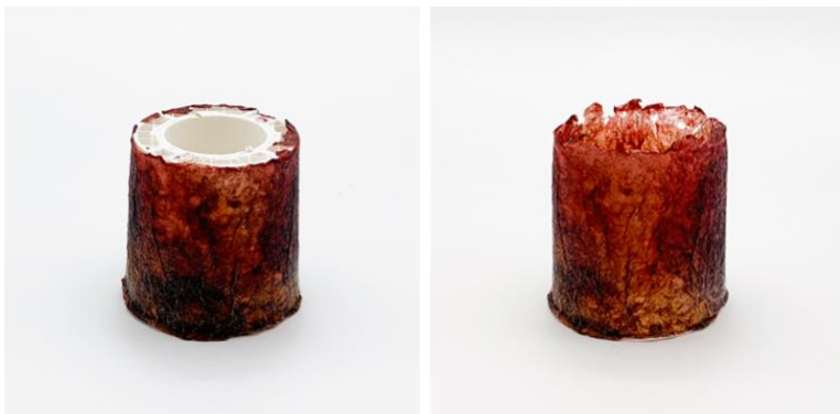
Figure 8. BC "tartare" sample over a 3d printed mold.

There is also the possibility of using the same strategy of the molds created with DFTs to make shapes from BC chopped, which is obtained from cultures that suffer defects on the surface or from scraps produced by other operations with BC. In Figure 8, it is possible to see the application of the same principle of the drawer mold in Figure 7 for the realization of the same shape using BC tartare. In this case the appearance of the final artifact is completely different and at the same time avoids the creation of overlapping parts of BC.