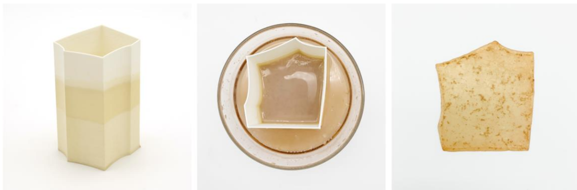
Figure 1. DFTs adopted to generate a specific BC shape while its growing, preventing secondary cut operations on BC samples.

An example of the first type of application of DFTs for BC growth can be seen in Figure 1, in which (from left to right) we can see a hollow shape affecting the BC growth into a cylindrical container. The hollow shape has been realised in PLA with a 3D Fused Deposition Modeling (FDM) printer and then inserted into the container of one of the cultures while growing. This procedure enabled the researchers in generating a final BC sample with an altered shape in respect to that of the initial container, that can be seen on the right side of the picture. This first methodological procedure shows that layers of BC can be produced with specific geometries, which do not necessarily have to undergo further cutting and shaping processes in post-production. Thanks to this strategy, it is possible to reduce the generation of waste of already dried BC after subsequent cuts. The scalability of this technique is particularly useful when products or components in BC need to be produced that do not have a shape like standard containers available in the market or when multiple sizes exist for the same production output (e.g., for products with different fits). During production, there will be no need to modify the growth tank system. Instead, preformed elements can be introduced into larger tanks using a nesting operation, maintaining production efficiency while also making it flexible.