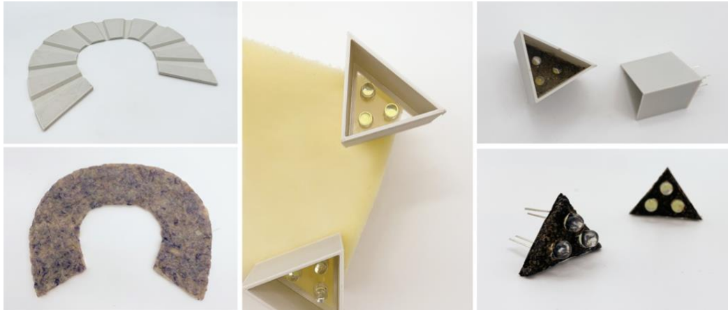
Figure 9. Examples of moulds and their use for making BC tartare elements with integration of other components and materials.

All the techniques introduced in this section, aimed at facilitating the creation of shapes dissimilar to that of a simple sheet, are intended to assist designers in understanding and visualizing the additional possibilities offered by this type of material. In fact, BC can be treated as any other material for production in a structured and comprehensive manner, but only once the changes in state it can undergo through various processes have been mapped and demonstrated. The ability to transform a material that originates in layers (thus two-dimensional) into three-dimensional semi-finished products greatly expands its potential design applications.