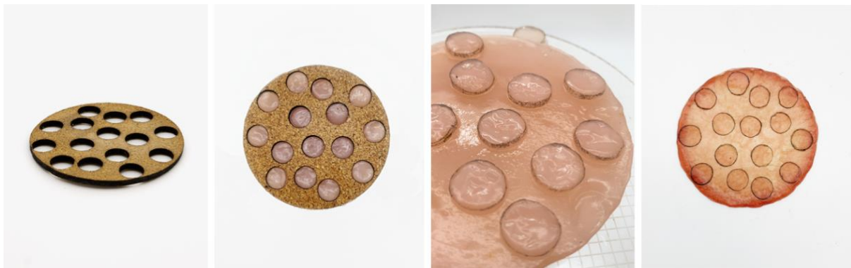
Figure 2. DFTs adopted to realise masks that enable designers in generating BC samples with different thicknesses.

When drying, this range will be drastically reduced, but will still be perceptible both to the eye and to the touch. The black edge visible around the most prominent dots is the result of burning the laser-cut cork. If this type of effect is not desired, other tools, such as the vinyl cutter, can be used to make the masks. This technique, like the one previously mentioned (visible in Figure 1), allows for a customized and flexible production of BC parts, in this case for elements characterized from an aesthetic point of view. Both strategies of modification during the growth phase can be combined, creating BC pieces with predefined shapes and textures for efficient application in the final product.