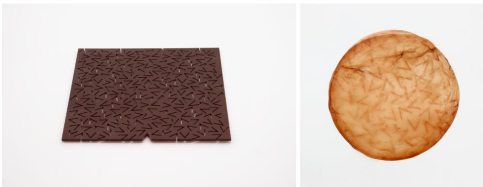
Figure 4. DFTs adopted to realise a negative texture sample, then impressed in the drying BC sample.

In Figure 4 it is shown one of the samples obtained by drying a BC layer by contact and compression with a PMMA sheet. The contact surface has been designed to present perforations (obtained through LC technique). During the drying phase, the texture impressed on the PMMA sheet was transferred onto the drying BC sample.