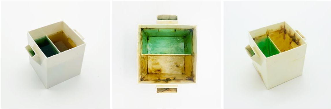
Figure 3. DFTs deployed for the realisation of growing chambers to realise BC samples with different colour shades.