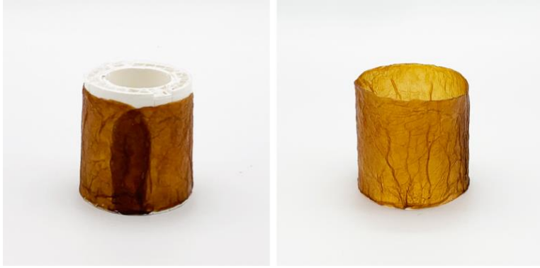
Figure 7. BC layer wrapped over a 3D printed mold.

In Figure 7, you can see how the principle of the drawer mould was applied to create a hollow truncated cone with a layer of BC, without having problems with removal from the mould downstream of the shrinkage of the dried material. Nevertheless, it should be considered how any material overlaps – visible on the left side of Figure 7 – are evident on the final output.