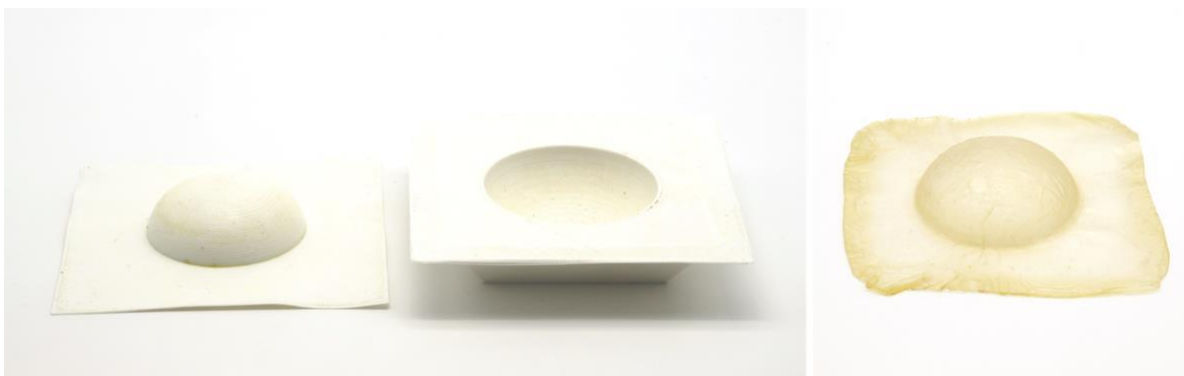
Figure 6. 3D printed mould to obtain a BC hemispheric sample and its resulting shape.

More in detail, an evolution of three-dimensional moulds, presented in the previous section, can serve as enablers for the creation of three-dimensional shapes through DFTs. Examples of some moulds made through AM with PLA printed in FDM and the resulting shapes in BC can be found in Figures 6-7. In Figure 6, it can be seen how it is possible to make a double curvature to a BC layer.