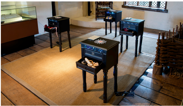
Figure 2. Insights Phase: Containers of Stories (2016).

(2) Insights Phase - We were motivated by the need to test our theoretical and contextual understandings (outlined previously) into practice. Inspired by the way house museums commission site-specific work from artists to present visitors with new interpretations of their sites, we organized a two-week exhibition at Bishops' House [12]. We invited three artists to respond to the place by creating work that explored the more recent history of the house: a series of large hand-drawn 1960s wallpaper panels that were overlapped onto the centuries-old timber frame walls [39]; a sound installation playing childhood memories of a woman who lived in the house in the 1970s before it was turned into a museum [56], and new interpretation boards that temporarily replaced the museum panels with a dialogue between imagined residents from different eras.