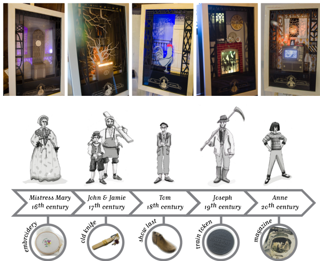
Figure 3. The tableaux and their corresponding characters, their associated century and their object.

of Bishops' House. Each tableau was designed as a miniature theatre set of a domestic scene, a possible view of the House in that century, as if the character lived in it (Figure 3, top). For example, Anne's tableau portrayed a family room from the 1970s with a TV set, while Tom's featured a bedroom shared with domestic animals (a mechanical cockerel) as it was common in the 17 th century (Figure 3, middle). Mistress Mary's 16 th century tableau included some of the original features in the House from that period. The characters were not represented inside the tableaux, although their name and period were engraved in the frame. They had just stepped out, but came back as if brought to life with their stories when an NFC-augmented object was presented to them.