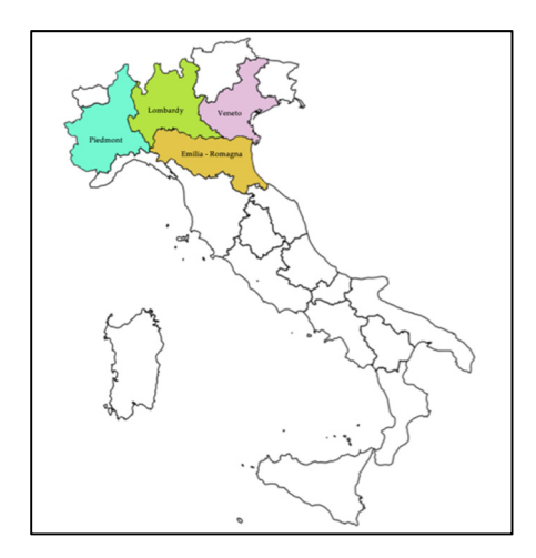
Figure 1. The most affected region during the first phase.

In May 2020, Italy had a total of 232,664 infections and 33,340 deceased, with 88,758 and 16,079, respectively, attributable to Lombardy alone, which in terms of percentage of deceased, was 48.23% of the national total (Table 2).