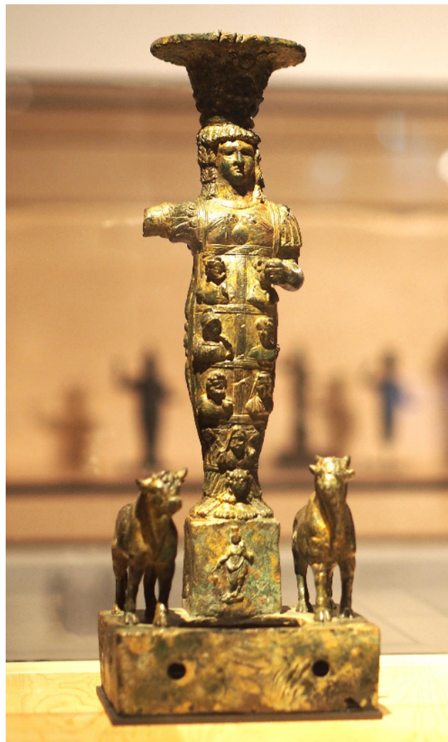
Figure 4. A bronze statuette of Jupiter Heliopolitanus.

The origin of this curious iconography has been sometimes attributed to tribal, pre-Roman deities, but there is no known pre-Roman image of this kind, although “standard” Zeus is documented in Iturean coins [9]. Another traditional interpretation is in terms of a solar deity, but besides the mysterious toponym “Heliopolis” attributed to Baalbek (the original Heliopolis of course was the main centre of the cult of the sun god Ra in ancient Egypt), we do not have any proof whatsoever of such a solar character. To complicate matters, research has been delayed for years by the idea that a triad of gods—Jupiter, Venus and Mercury—was actually worshipped in Baalbek through a syncretism with local deities (Jupiter with Hadad, an ancient Mesopotamian God of Thunder, and Venus with Atargatis, a marine deity). Only recently has this idea of a “Heliopolitan Triad” been shown to lack solid evidence [8].