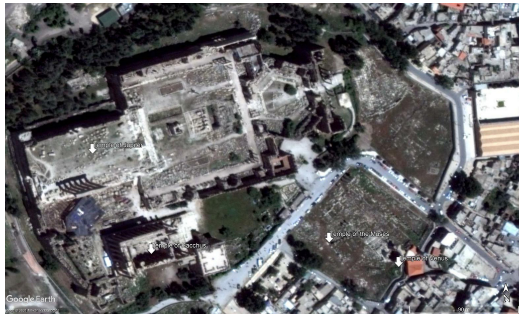
Figure 2. The temples of Baalbek (Image courtesy of Google Earth, editing by the author).