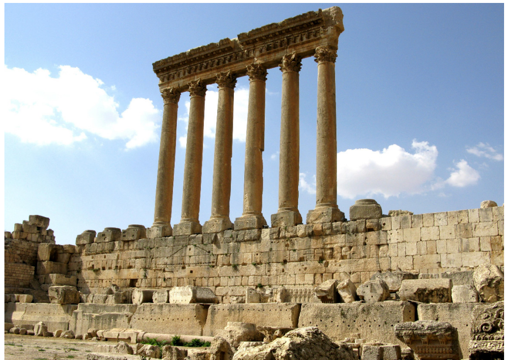
Figure 3. The southeast side of the Temple of Jupiter. In the foreground, the huge blocks of the external wall, almost identical in shape and size to those of the Western tunnel in Jerusalem. The podium, with squared masonry, is also very similar to Herodian walls on the Temple Mount.