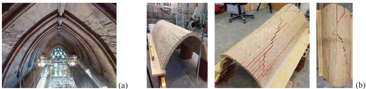
Figure 1: (a) Bothwell Parish Church (Glasgow, UK) barrel vault [14] and (b) crack pattern observed in the experimental test [13].

As an example, we study a reproduction of the historical barrel vault which constituting the roofing of the central nave of the Bothwell Parish Church (Glasgow, United Kingdom, see Fig. 1(a)). An in-depth geometrical survey revealed that the vault is slightly skewed, with cracks that has opened over the years due to settlement across the less braced South edge. In [14], this response of this vault under foundation settlements has been investigated by means of finite element analyses and several experimental test (also carried out in [13]) on a 1/12 scaled model (Fig. 1(b)). The actual vault geometry features an interior span of 6.1 m, a rise of 3.8 m, and a length of 16.8 m, and an average thickness of 36 cm. We assume a 520 kg/m 3 density for masonry material. Finally, in order to better reproduce sliding deformations observed in the experimental test performed in [14], a 3D Mohr-Coulomb failure surface with tension cut-off and compression linear cap is assumed, with ultimate tensile and compression stresses equal to 0.03 MPa and 2.6 MPa respectively. Shear failures are controlled by a cohesion of 0.02 MPa and a tangent of the friction angle of 0.5. To replicate the experimental test, in the first numerical simulation, a vertical linear settlement has been applied (see Fig. 2), with a 1 cm maximum drop along the external edge.