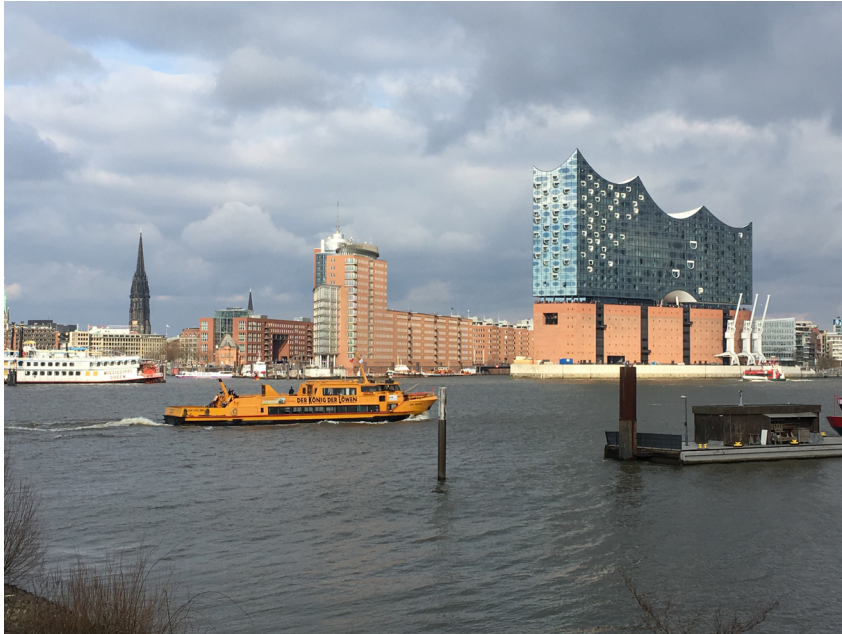
FIG. 1 The Elbphilharmonie

architectural mundanity of MediaCityPort. From 2002 to 2003, they lobbied for the idea of an iconic concert hall placed on top of the Kaispeicher and designed by the two newly crowned star architects. In 2003, they introduced Herzog & de Meuron's visualization to the media, launching what later would be called the Elbphilharmonie to the public. This proposal, henceforth, garnered media and civic support. The German weekly news magazine Stern 17 reported favorably on the proposal in June 2003. The first big article appeared locally in the Hamburger Morgenpost in August 2003. A few months later, the Hamburg Senate abandoned the MediaCityPort project and eventually in October 2005, the Hamburg State Parliament consensually approved building the Elbphilharmonie on the basis of a feasibility study and authorized the Hamburg Senate to award the project.