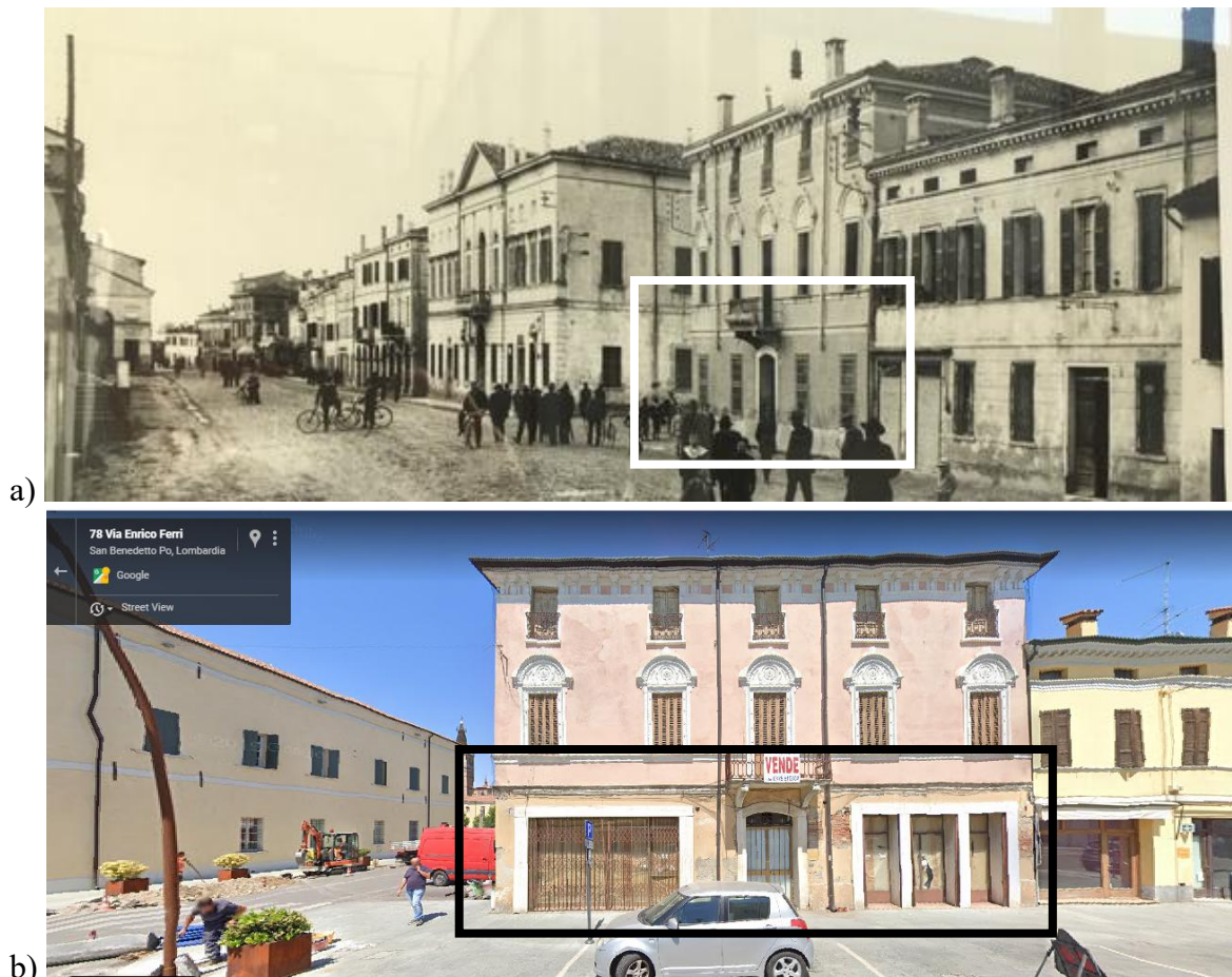
Figure 2: Transformations: a) XX century image of a traditional Italian historical center with the detail of a three storey building, b) widening of the original openings, compromising resistance to horizontal actions.