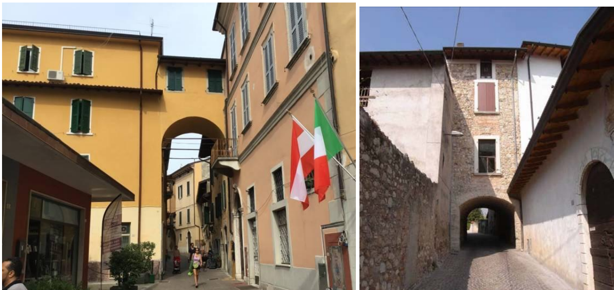
Figure1: Typical views of historical aggregates.

Starting from the traditional approach to vulnerability evaluations, based on the analysis of single structural units, new procedures have now to be formulated, extending consideration to entire structural aggregates, in view of the development of wide damage scenarios at the urban scale. Recently, this specific need has been formulated by the Italian Civil Protection Agency as a support to the development of Civil Protection plans; specifically, in accordance with the typical nature of the Italian built environment, the study is focused on the vulnerability analysis of historical aggregates of ancient urban centers (Fig. 1).