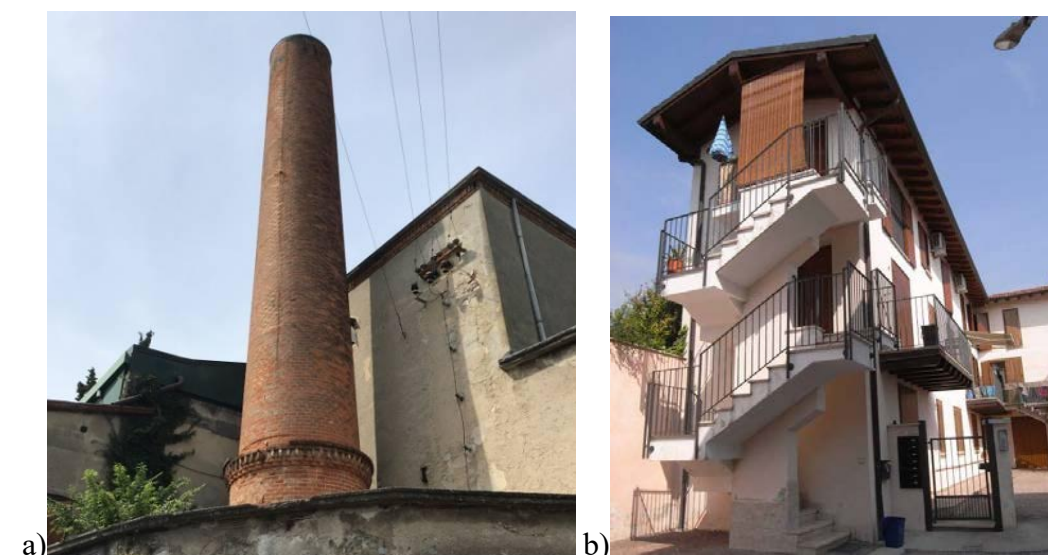
Figure 4: Fragilities in the structural units: a) slender elements; b) elements protruding on the road.