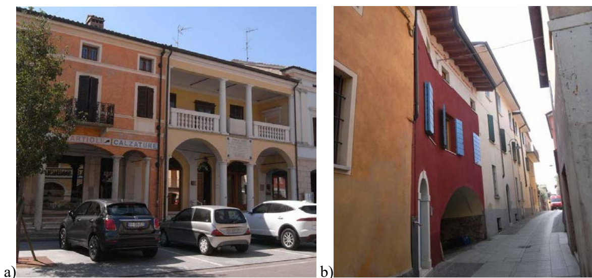
Figure 3: Fragilities in the structural units: a) porch and b) covered walkways.

The development of a new procedure for vulnerability analyses, as it has been presented in this work with reference to the special case of structural aggregates in historical centers, has to face still now the problem of defining meaningful numerical values for the different evaluation parameters. The solution to this problem necessarily requires the recourse to a wide statistical campaign. In general, the formulation of a meaningful procedure for seismic vulnerability analyses still remains a complex problem, also in consideration of the need to develop an fast, clear, and stable procedure, suitable for the use by a wide community of technicians.