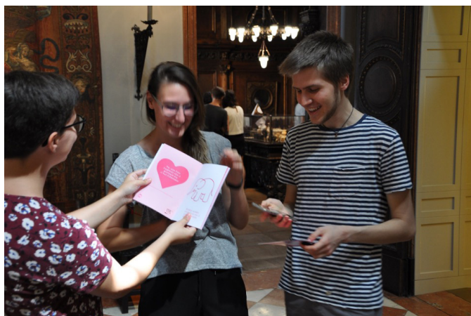
FIGURA 4 Students performing one of the playful activities proposed by the game Wreck this BaVa

Instead of looking for cultural relevance by building coherent fictional stories, Wreck this BaVa uses the museum assets in a bold, sometimes shameless, way, as pure triggers of playful activities. Examples are taking a selfie with the painting, or activating AR mini-game over artworks. The mainstay of this location-based activity relies on its ability to trigger playful and enjoyable activities mainly aimed at having fun with friends. Comments from players reinforce the potential of the game for social engagement. They underline that the game is "enjoyable with friends" and "facilitates social engagement". Furthermore, the game is described as "an opportunity to get around the museum far and wide" and come back for repeated visits, since "the experience invites visiting the museum several times, to test new games and augmented features". It is also noticeable the designers' will to enhance the museum's outreach, by asking players to perform fun performances and tasks across the city, raising the museum's visibility and "advertising" its activities.