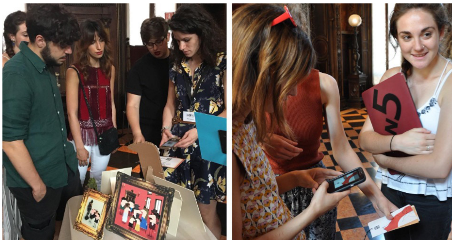
FIGURA 3 A group of students scanning a QR code to start testing the game The Crime (left), and students introducing players to the game Next, please (right)

In The Crime , designers emphasised the educational dimension, focusing players' attention on often unnoticed details. Players reported that the game made them discover and remember the museum's assets and rooms. Furthermore, they considered it fun and “a new enjoyable way to experience the museum, paying attention to details”.