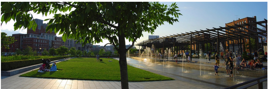
Fig. 2. Current view of the Northend Parks.

A steel pergola lines one side of the site and is the conceptual “front porch” of the North End neighborhood, complete with site furnishings that encourage its use, makes it an “exception” as described by [5]. A reflective water feature separates the porch from a series of lawns and perennial gardens. Through the park design on the circumference by streets and walkways (North Street, Hanover Street, and Salem Street walkways) reconnect the City to the North End; Each cross the gardens, water feature and pergola. The site's rich history is reflected in interpretive elements that include granite marking the edge of the Mill Pond and the water's edge, descriptive quotes and a timeline engraved in leaning rails, and an engraved stone map illustrating the changing landform of the site, see Fig. 2.