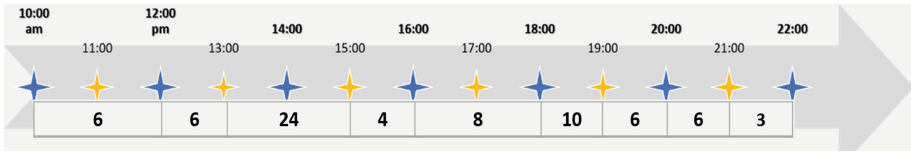
Fig. 4. Timeline of the Surveys conducted during the month of July 2017.

strategic location in the city Downtown area. 6 interviews were conducted with 4 different stakeholders entities and 2 urban planners, most of interviews stressed on conserving the livability of downtown area; whereas the Northend park case study is; in addition to work on equitable cultural programming, inclusiveness and resilience in planning processes, wayfinding, and safety issues.