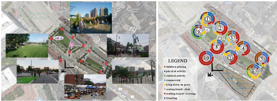
Fig. 3. Left -Observation Points Base map with exemplary views from around the Northend Park, April/July 2017. Right - Mapping Stationary activities in ten Observation points.

has been analyzed a tendency of 37% towards the usage of the public space from the surrounding inhabitants of the Northend district. Considering the strong influence of the park parcels in shaping the cultural aspect of the neighborhood, it is significant that most of the frequent users are from the same zip code of 02113 whereas the park is. Nonetheless, a noteworthy female attraction of 14% of survey takers during the weekends of 16 th and 22 nd July due to good weather conditions (recorded an average temperature between 19 and 28 °C) and planned Musical Concerts from 5:00 to 7:00 pm. In the interim, the age and gender differences were not substantial, both categories scored between 34 and 38 years as most significant quantiles; a noticeable low correlation of 0.80 between gender and age in the survey results.