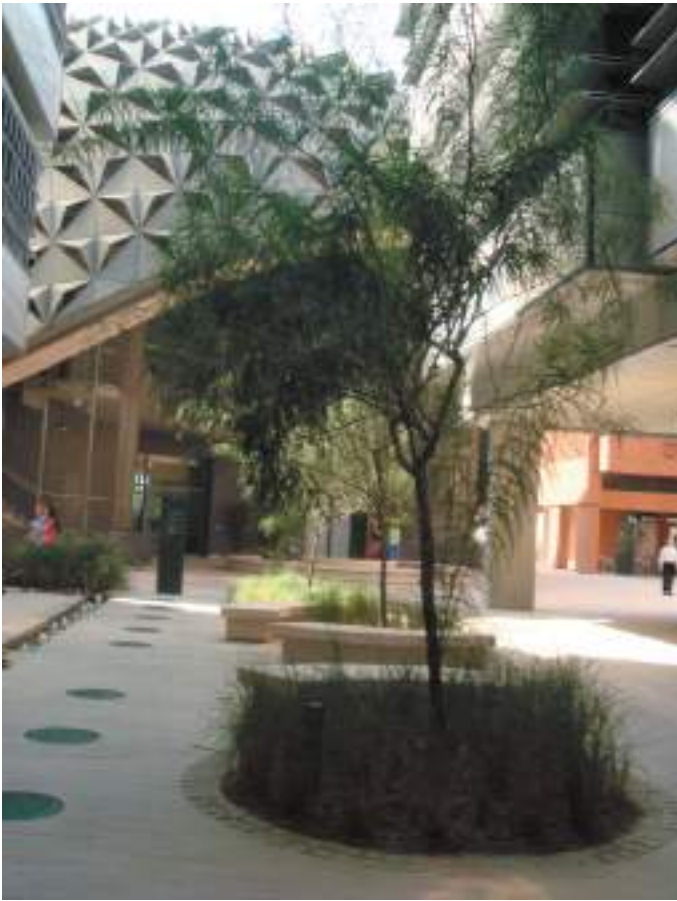
01 | View of Masdar City pedestrian spaces

interaction also changed significantly pro-actively up to a lively final debate among all, including in connection with prof. Scupelli video conferencing from Carnegie Mellon (Fig. 3).