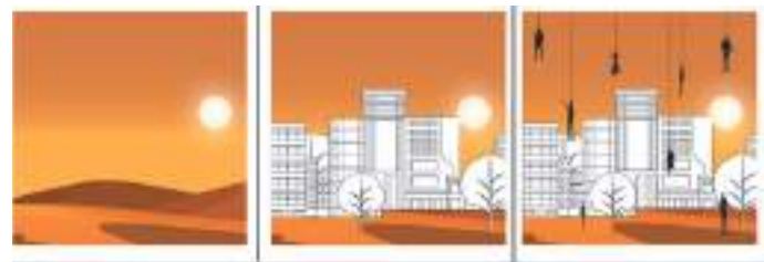
1. Natural environment. 2. The city is designed all at once. 3. People as additive elements, not like users.

It becomes essential to understand: how far to go, to ask them: how far is their future? What are their concerns and expectations? What future to include in the vision of their projects? What perspective besides the anthropocentric one remains possible? How many futures are possible?