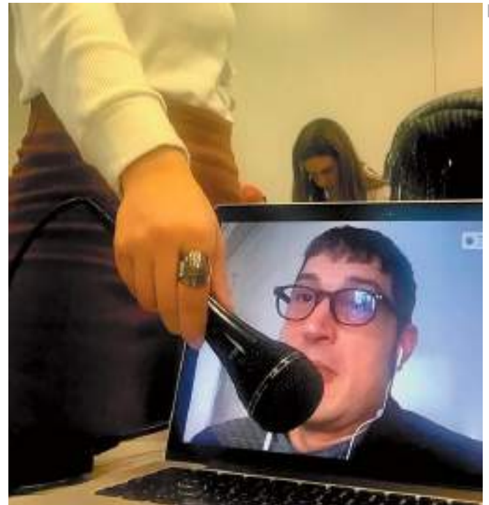
03 | Dexist Futures: flipped classroom

especially in a newly founded city like Masdar. Instead, a homogeneity of vision and values is achieved where the future is viewed through the lenses of the climate and its transformations, a topic that seems to make any national distinction inappropriate. Therefore, if the theme of futures is placed in a climatic framework, the concept of country of origin fades before a unitary environmental framework.