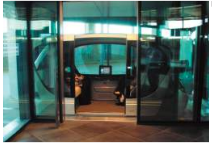
02 | View of Masdar City with a self-driving transport

The composition of the class is varied in geographical terms, over 20 different nationalities. This adds to the idea of the future, a multi-cultural dimension that makes the comparison, and debate on the meaning and values of the future, more interesting. Different questions emerged about the value of history and memory, which in the projection seem to become the strength of the project's range,