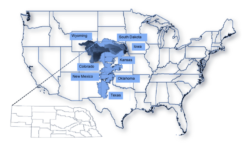
Figure 1. Platte River Basin (PRB) and Nebraska's natural resources. The deep blue tones evidence the main topographic features and PRB's sub basins. The light blue area is the High Plains Aquifer. At the bottom, it can be seen the state of Nebraska and its 23 Natural Resources Districts.

relied on Ostrom's design principles for common pool resource institutions, because of its "bottom-up" perspective. Nebraska's unique system can represent an alternative to manage common pool of water resources worldwide. Water management in Nebraska includes a statewide agency, Nebraska Department of Natural Resources (NeDNR), with primary statewide authority over surface water, and 23 Natural Resource Districts (NRDs), public entities with taxing authority and primary responsibility for regulatory control over ground water (Figure 1). When state lawmakers established the NRD framework in 1972 there was a consensus that boundaries should follow surface watersheds and that local control was important to the citizens of Nebraska [4]. NeDNR and the NRDs are jointly responsible for facilitating the development of integrated water management plans.