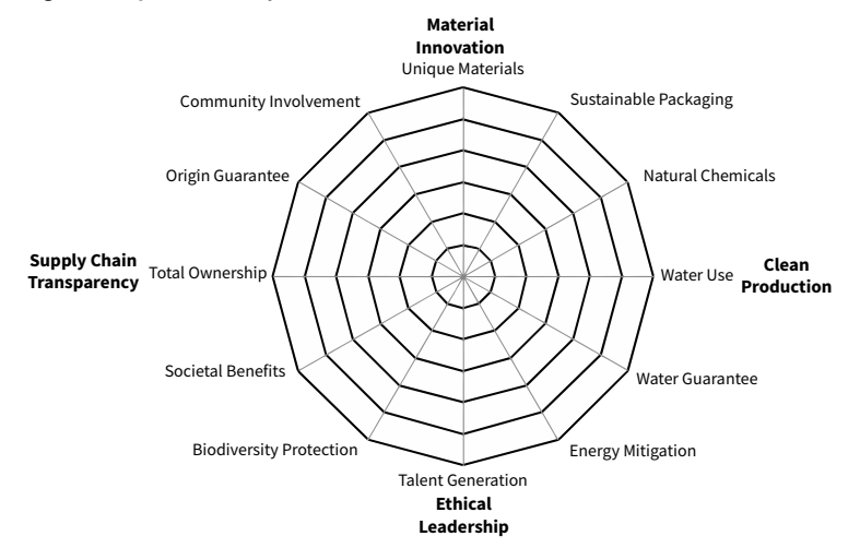
Figure 1. Responsible Luxury Radar

We designed the Responsible Luxury Radar , through interactions with responsible luxury companies and their senior management. The radar and the practices are determined by the