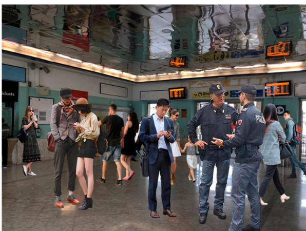
Figure 1. Example of treatments of the internal areas of the station.