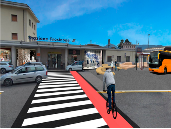
Figure 2. Example of treatments of the external areas of the station.

It is well known in the literature that SP surveys allow one to obtain a greater number of observations than RP surveys for the same sample size, since each SP respondent is exposed to more choice scenarios than in RP survey (which considers only the actual context). They also allow one to take into consideration service quality attributes not present in the current scenario. However, this might generate some distortions due to possible discrepancies between the stated choice behavior and the actual one. This happens particularly due to unrealistic (i.e., unlikely) contexts, lack of relevant attributes for the decision maker in the scenarios, and fatigue of the interviewees by completing too many treatments. However, using some precautions, it is possible to avoid the above undesirable effects, and, in fact, several authors have already successfully used a similar approach [25–27].