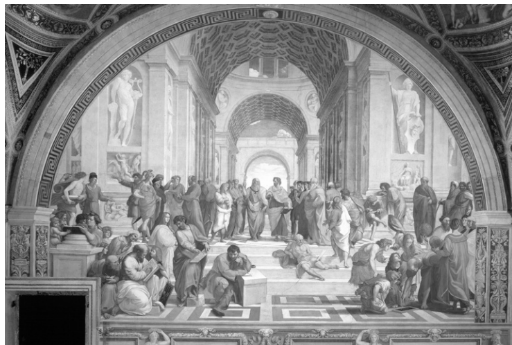
Fig. 1: The School of Athens by Raphael, 1509–1511, fresco in Stanza della Segnatura , Vatican Museum, Vatican, Rome