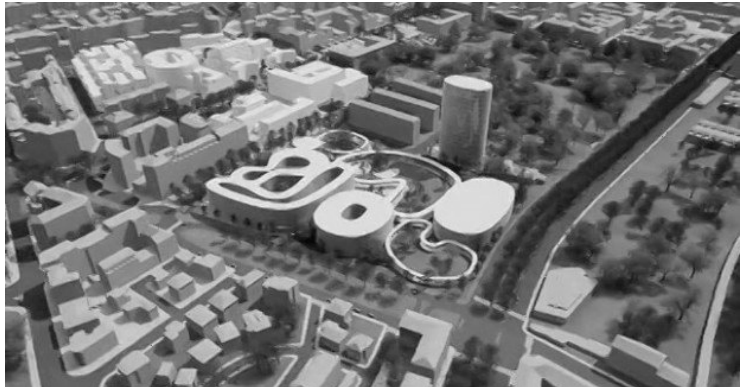
Fig. 4: The urban value of the new Bocconi Campus in Milan. Grafton Architects (2003–2008) on Viale Bligny and SANAA 2015: the University is expanding to the south, incorporating the former area of the Centrale del Latte (former milk collection and processing plant for the entire municipality of Milan). The striking forms of the new campus will revitalize and interact with the surrounding urban fabric.