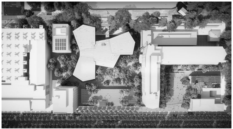
Fig. 3: The urban value of the new Bonardi Campus at Milan Polytechnic: from Giò Ponti, Piero Portaluppi, Giordano Forti Project (1953–61) to the Vittoriano Viganò Building (1970–85) to the new pedestrian path between the trees designed by Renzo Piano, (2015).