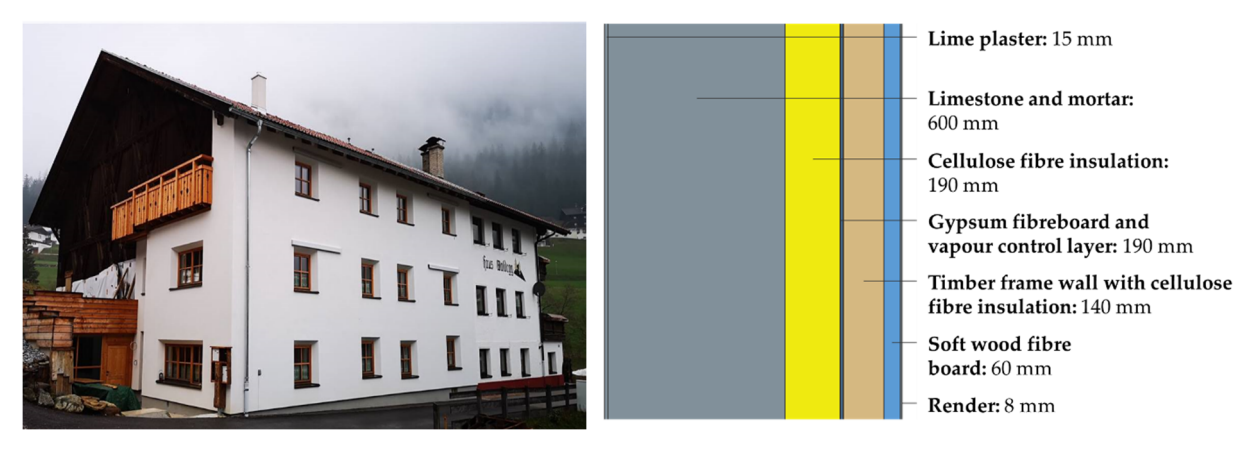
Figure 1. Example of reversible external wall insulation: picture ( left ) and cross-section (( right ), layers presented from inside to outside) [69].