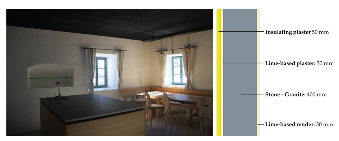
Figure 2. Example of internal wall insulation with insulating plaster: picture ( left ) and cross-section (( right ), layers presented from inside to outside) [70].

The application of insulating plaster as a means for internal wall insulation (IWI) allows for an improvement of the overall thermal performance of the envelope while maintaining the appearance and materiality of the wall externally and replicating it internally. The use of thin layers ensures respecting the original spatial characteristic of the wall and room, while facilitating replication of the original appearance of the wall (if the original internal surface was plastered) by reproducing any pre-existing unevenness, as shown in Figure 2.