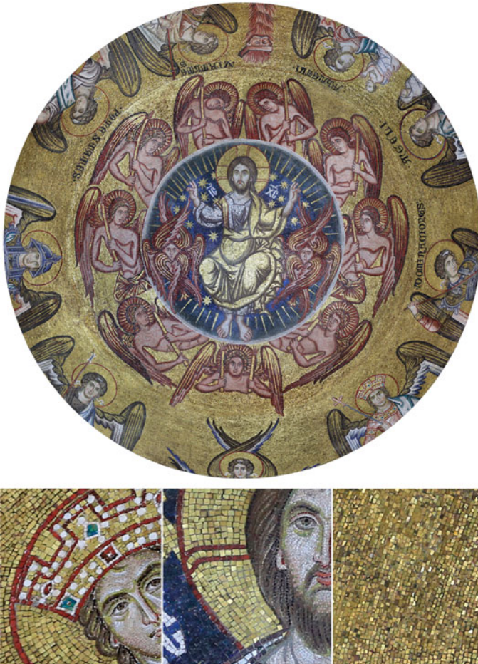
Fig. 5 The orthophoto of the dome of Baptistery, (top), with some details (bottom) where it is possible to see the smallest details of the golden tessera in the orthophoto (pixel size of 0.5 mm)

In the most complex areas, domes, vaults and connecting elements, it was decided to use simplified reference planes.