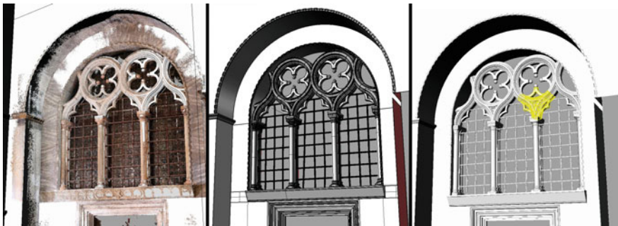
Fig. 1 Example of modelling by NURBS. From the left: pointcloud, geometric model and final result with a single element highlighted.

Considering all these difficulties, it was decided to use a modelling approach based on NURBS. This system combines the possibility to have a reliable representation of reality and easy to manage processes, at least in terms of memory occupation. Other alternatives such as parametric or mesh modelling, widely used in the industry, have in fact proved to be particularly effective only in one of the two areas (model accuracy, ease of use), but very weak in the other. The negative factor of the NURBS approach is the very low level of automation: all operations require a strong manual intervention of the operator and, therefore, make the entire construction phase of the model very expensive in terms of time. The work pipeline has provided researchers to start from the point clouds, obtained by photogrammetry, and then build basic and generating profiles for sweeping, extrusion and loft operations (Fig. 4). In some specific cases, such as domes or more complex elements, profiles were extracted at close range and then modelled using commands such as 'loft' or 'network of curves'. Even the most