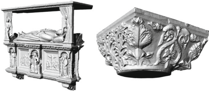
Fig. 2 Examples of sculptural elements modelled by mesh approach.

complex elements, such as capitals, where possible were represented as NURBS (Fig. 4).