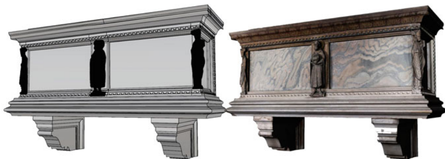
Fig. 3 The same object represented only with geometric information (left) and with texture extracted from georeferenced images (right).