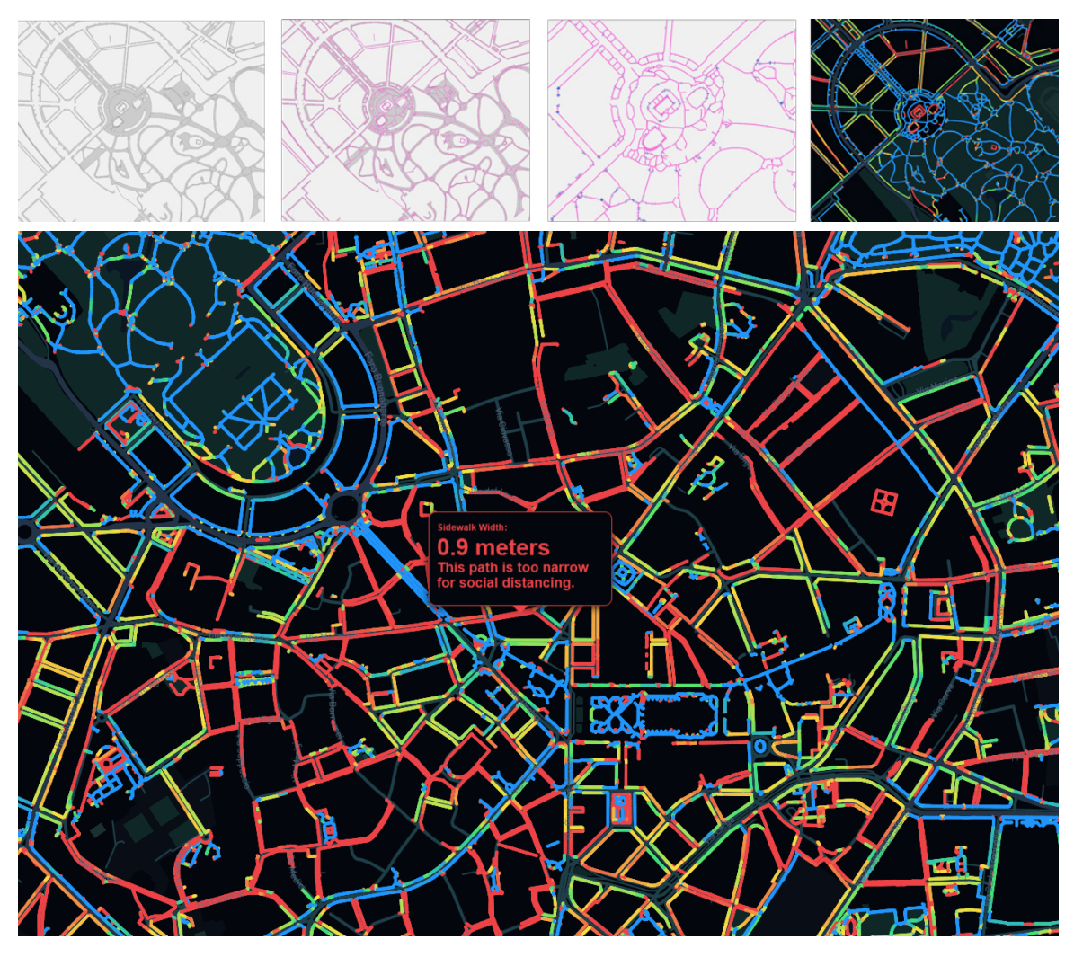
Fig. 6 A screenshot from the interactive map showing sidewalks widths in Milan and highlighting the critical areas where physical distancing cannot be respected: very difficult (less than 2.4 m), highlighted in red; somehow doable (between 2.4 and 3.3m), in yellow; doable (between 3.3 and 4.2 m), in green; easy (more than 4.2 m), in blue.

infrastructural characteristics of the sidewalks network<sup>23</sup>. Starting from the recommended interpersonal distance of 1 meter for contagion containment, the analysis considered the space occupied by each person (0.6 m + 0.2 m of comfort zone) and applied 1 meter spacing assuming different sidewalk sections. In this way, it was possible to define intervals to evaluate the level of suitability of sidewalks based on their width.