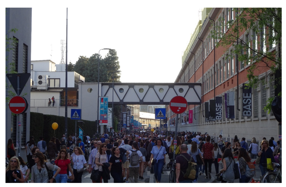
Fig.1 People invading roads during last edition of the Design Week (via Tortona).