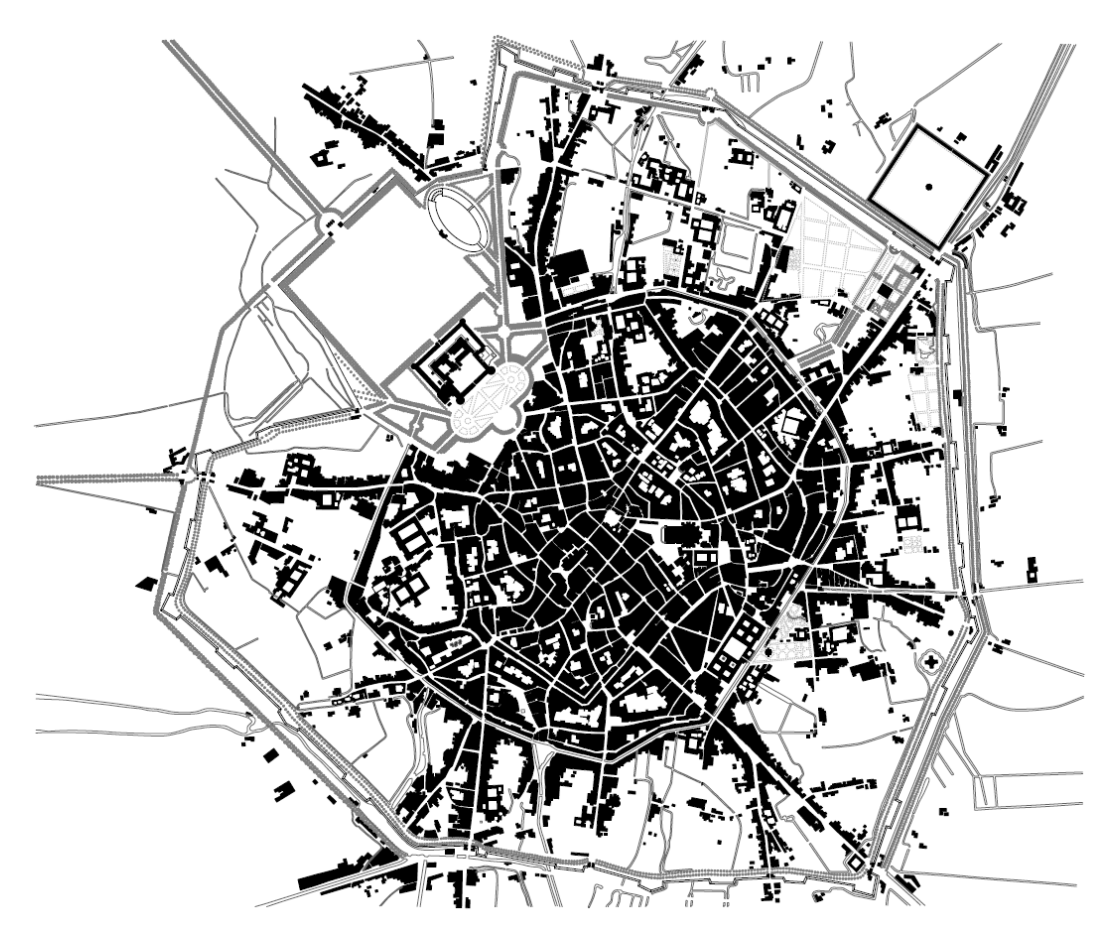
Fig. 3 A "figure-ground" interpretation of the Milan historic texture ("Milano 1840" by Charles P. Graves).

So far, the pedestrianization has been a must for major urban projects transforming strategic dismissed areas, as well as for city centers and historic nucleus. But now a new walkability demand is emerging, in order to integrate in a shared space a slow mobility mix: a hybrid and resilient walkability. As a quick answer to the virus pressure on mobility, this new walkability paradigm should be extended to the whole consolidated city in the metropolitan core and to the urban textures of the district cores. Today a resilient approach with temporary solutions focused on space textures is mandatory, considering the health situation, which is now leading the regeneration demand, with emergency and new-normal phasing. The traditional invariant becomes resilient: the spatial structure of the public realm becomes a platform for ever-changing mobility, services, and quality of life. A new vision integrating mobility and services and outdoor living for communities, users and tourists. A new challenge integrating place making, street design and transportation programming, towards a comprehensive resilient design approach, for intelligent living landscapes.