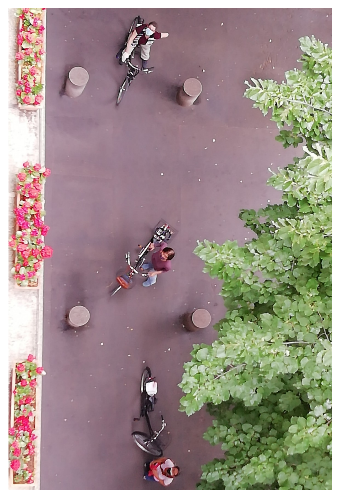
Fig. 4 Bikers in Foro Bonaparte at the first day of the re-open phase.

Facing this trend, advanced urban planning activities are shifting towards a focus on walkability, with regard to the development of strategies and design elements which enhance the accessibility, comfort and safety of the urban setting for walking, considering also the needs of vulnerable road users (e.g. pedestrianization of urban areas, barrier-free streets, public spaces for outdoor activities). According to the General Theory of Walkability (Speck, 2013), the essential elements for evaluating the level of walkability of urban environments (Gorrini & Bertini, 2018) comprise the following: (i) presence of services within a walkable distance; (ii) level