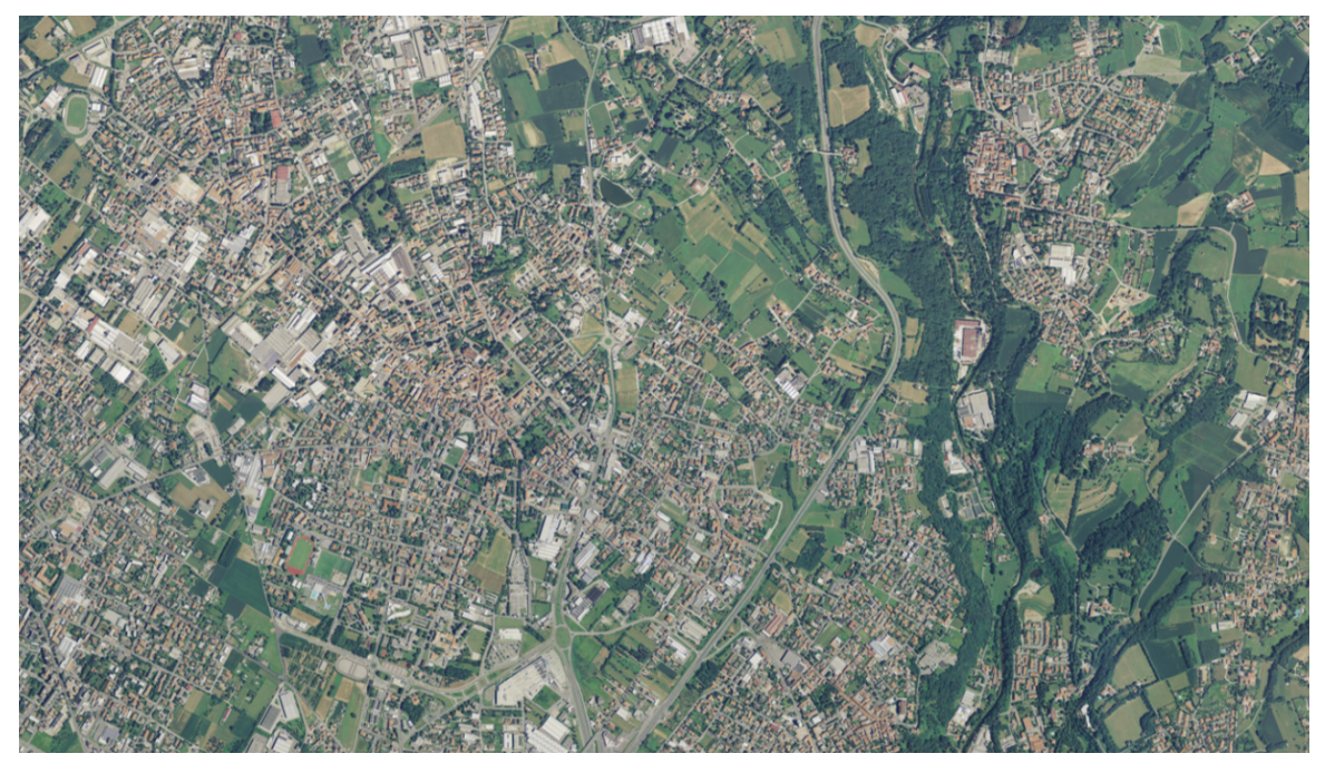
Fig. 2 The resilient hybrid texture of manufacture districts (Brianza).

The food production, with its organic and "zero-km" added value and new HT cold chain techniques and logistics, is also re-organizing these territories as food districts.