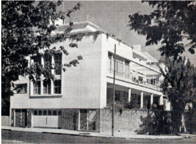
Fig 2. Experimental design. Columba House (Antonio U. Vilar, 1940). © Original state: Revista Nuestra Arquitectura, Noviembre 1943. Current state: Carolina Quiroga.

Argentina yet with construction companies with great experience in new materials, unlike in Europe where many early modern buildings were technological tests. However, the material experimentation must be confronted with present environmental demands and resource scarcity as far as criteria of energy self-sufficiency, reuse of materials, greening, low maintenance, among others are concerned. (Fig. 2)