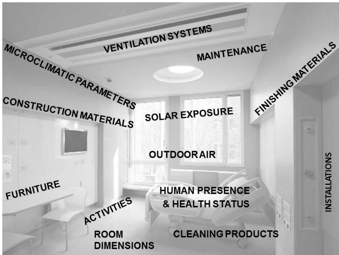
Figure 1. Factors that affect hospital environments.

acute health status, with different immune responses, people with disabilities elderly, etc.), and for the times of permanence in the hospital [29–33].