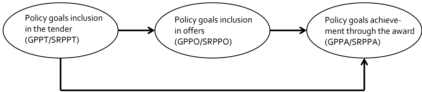
Figure 1 Initial conceptual framework