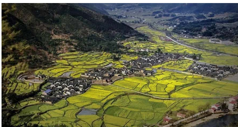
Figure 1. Aerial view of the village from North

The dense forests along the Yellow River in ancient China provided abundant wood resources more accessible than other building materials. In formal terms the structural wooden frame provided great freedom when constructing dwellings and its plan could assume many shapes. In structural terms the main advantage is its resistance to earthquakes, since the elastic quality of the wood and the flexibility of the joints make these structures earthquake resistant; although sometimes masonry walls might fall apart, the wooden frame would usually stay stand [3]. In fact, exclusively the wooden frame supports all the loads of the buildings so the internal walls have mainly enclosure and distribution purposes (besides their contribution to the structure stiffening) which results in a great flexibility in the realization of doors and windows and their material choice. This feature made it possible to adapt the system to the multifarious conditions of the vast Chinese territory according to the local climate.