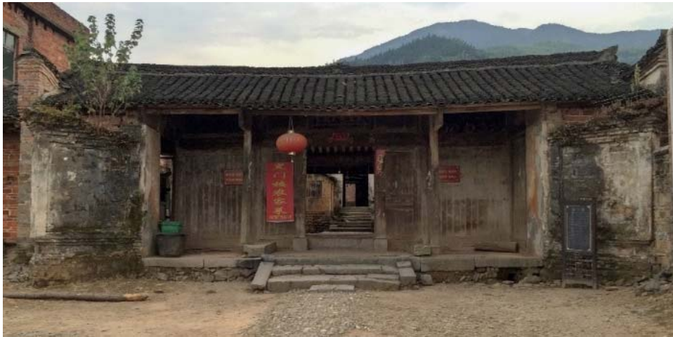
Figure 2. Main façade of the Black Gate Mansion. August, 2016.