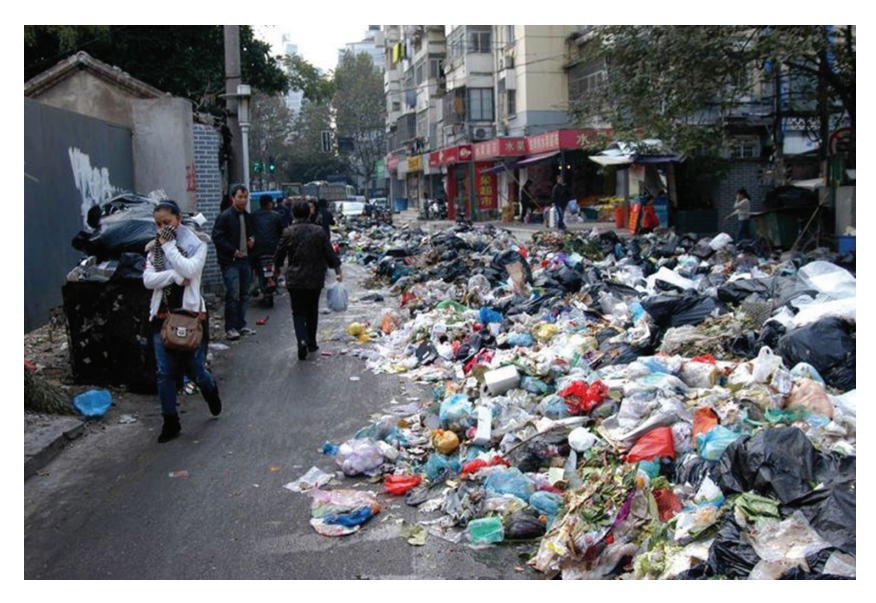
Figure 3: Waste disposal in the Rocinha.

In Rocinha, streets are narrow and the lack of space is a significant constraint in waste management procedures. The collection stage is performed by a municipal enterprise, but waste collection points are not enough and sometimes they are not even accessible, because of their location along the most congested roads [10]. Moreover, the frequency of the collection is not sufficient, and this fact is the main cause for both the spreading of the waste in the surrounding of collection points and the illegal disposal (Fig. 3). The magnitude of the problem is fully understandable just considering that improper disposed waste is estimated to be about 41% of household waste (0.59 kg/hab/d out of 0.78 kg/hab/day of average waste production per capita).