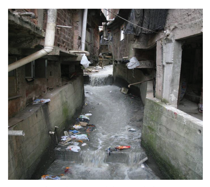
Figure 5: Open canals between the houses.

prudential reference values, an average of 150 litres/(person day) of water consumption has been considered. This value is referred not only to the daily average and the annual peak of water supplied by the water distribution system, but also, as mentioned, to possible contribution of harvested rainwater and also of a possible component of stormwater entering in the sewerage system.