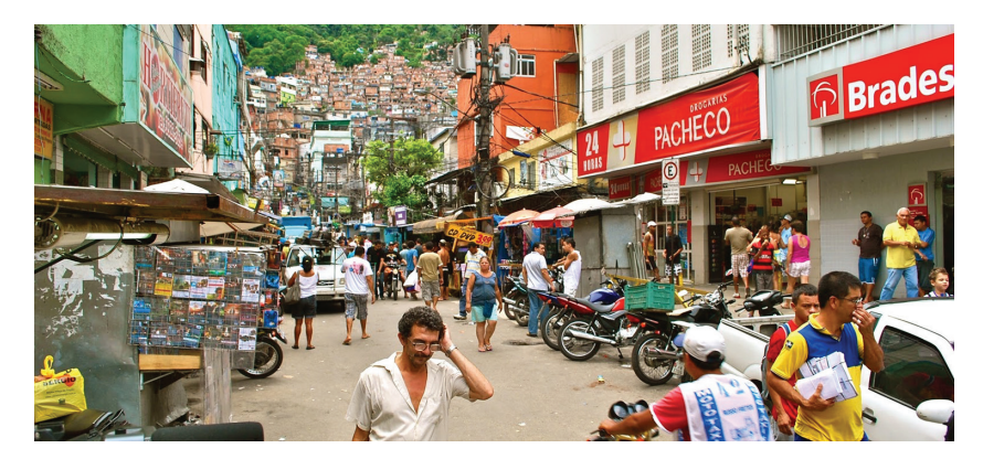
Figure 2: Life in the favela Rocinha.

the streets, limited access to healthy food and clean water, nonexistence of an effective system to collect and treat wastewater, and an ineffective mobility system are among the basic issues.