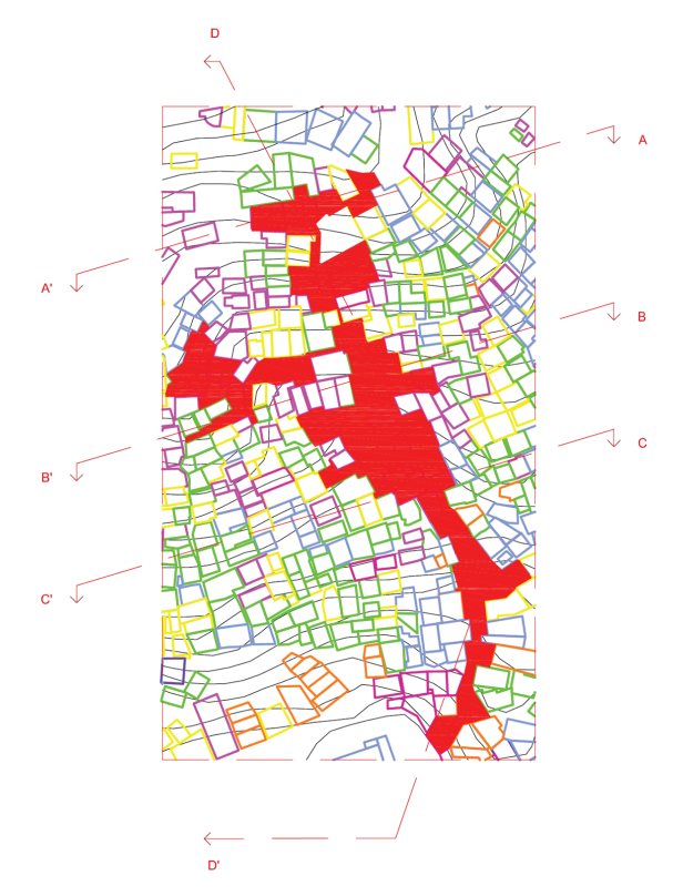
Figure 6: Pilot area for the design of the sewerage system.

laying pipes on street sidewalks, if present, or on a side of the passage between buildings, therefore accepting potential high water velocities inside them. Small drops have been considered only when velocities exceed 5 m/s. It has to be highlighted that, in the most upstream pipes, low flows could cause water velocities to be too low to avoid sedimentation of suspended solids. In these cases, it is possible to send part of stormwater flow from roofs into the pipes in order to have an occasional washing during storms.