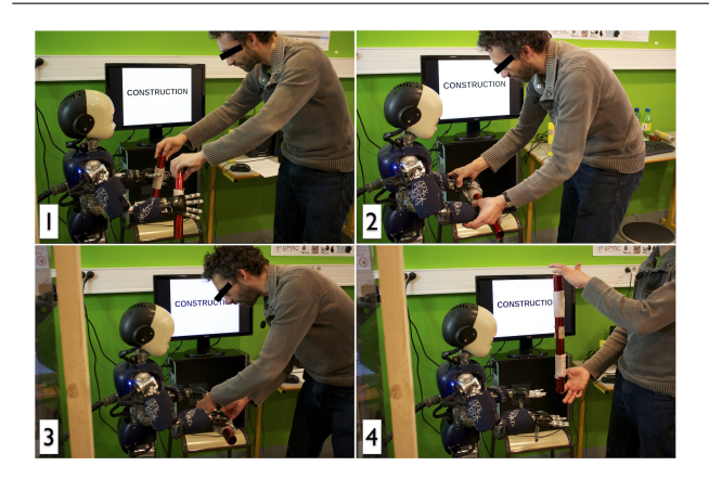
Fig. 4: In [Ivaldi et al., 2016] naive participants (not expert in robotics) interacted with the humanoid iCub to build an object: the physical interaction was at the level of the arms, covered by a soft tactile skin.