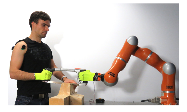
Fig. 3: Authors in [Peternel et al., 2016b] proposed a human-robot comanipulation framework for robot adaptation to human fatigue. The myoelectric interface provides the robot controller with a feedback about human motor behaviour to achieve an appropriate impedance profile in different phases of the task. The human fatigue estimation system provides the robot with the state of the human physical endurance.

A remarkable use of bio-signals in the development of HR interfaces is to estimate the human physical (e.g. fatigue) or cognitive (anxiety, in-attention, etc.) state variations that might deteriorate the collaborative robot'(s) performance. The authors in [Rani et al., 2004] developed a method to detect human anxiety in a collaborative setup by extracting features from EMG, electrocardiography (ECG) and Electrodermal responses. In a similar work, the human physical fatigue was detected and used to increase the robot's contribution to the task execution [Peternel et al., 2016b].