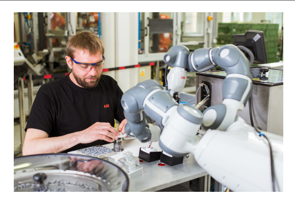
Fig. 2: An example of human-robot collaborative manipulation in a productive environment.

standing the wide margin of applications, collaborative tasks that involve simultaneous interaction with rough or uncertain environments (e.g. co-manipulative tool-use) can induce various unpredictable force components to the sensor readings [Peternel et al., 2014]. This can significantly reduce the suitability of such an interface in more complex interaction scenarios since it can be difficult to distinguish the components related to the active counterpart(s) behaviour from the ones generated from the interaction with the environment.