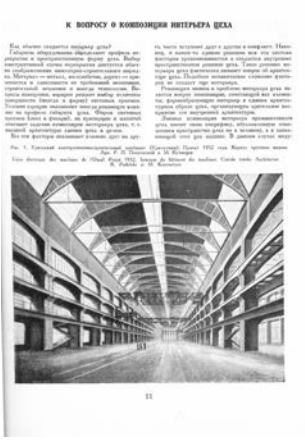
Figure 6-7. Akademija Architektury , 1935, N^\circ 3, Jurnal of Soviet Academy of Architecture