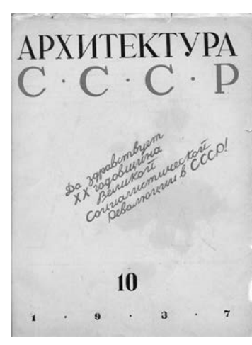
Figure 8. Architektura SSSR, 1937, N° 10, Jurnal of the Union of Soviet Architects