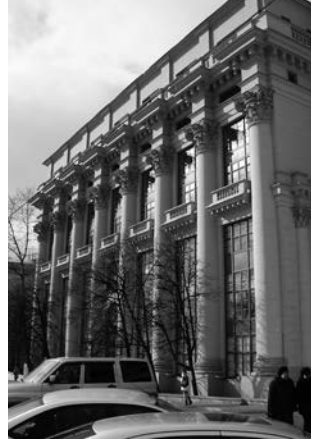
Figure 3-4. Ivan Žoltovskij, Dom na Mochovoj, Detail of Palladian order and main facade, 1934