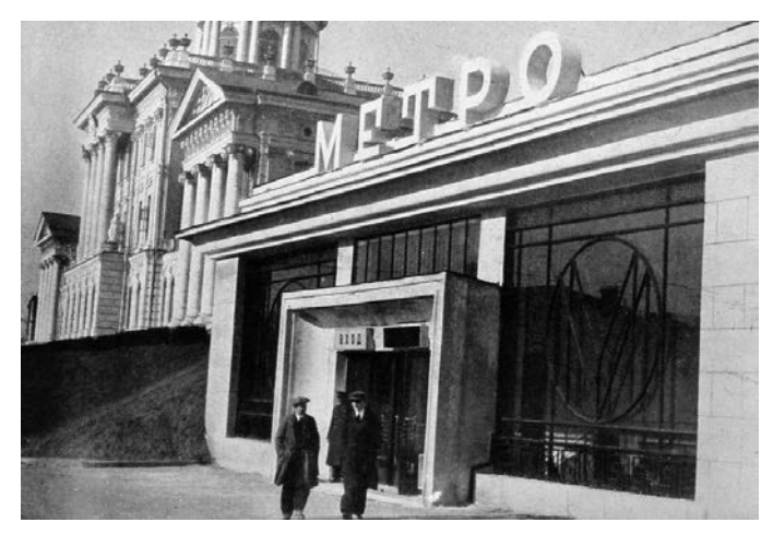
Figure 9. Entrance pavilion to the subway station of Ul. Kominterna (Lenin Librery), 1935

The Moscow underground<sup>29</sup>, which in the 1930s ranked as the regime project par excellence , was designed and built as the new currents were developing and consolidating their terrain. Indicated as a benchmark experience in the Socialist Realism research, the work remains a highly eloquent example of those times. From Ivan Fomin's employment of the so-called "red Doric" simplified and modernised neoclassicism<sup>30</sup> to Nikolaj Ladovskij's<sup>31</sup> work as one of the leading exponents of the Rationalist avant-garde, or the stations