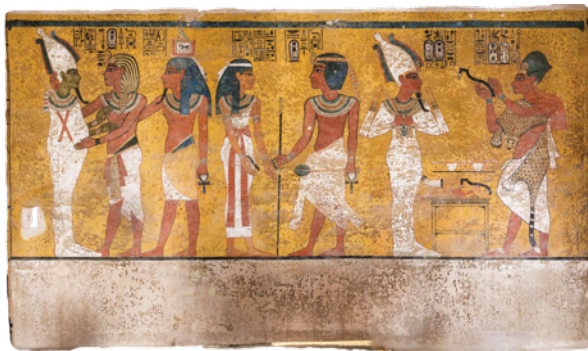
Figure 3: ortho-corrected image of the as-found condition of the north facade of the burial chamber of the Tomb of Tutankhamen after conservation, The Getty Conservation Institute and Carleton University.

Following Letellier (2011), CIMS, utilizing appropriate and suitable technology such as 3D scanning and photogrammetry, produced high-resolution ortho-corrected photographic elevations with millimetre resolution and accurate colour correction (see figures 1, 2 and 3).