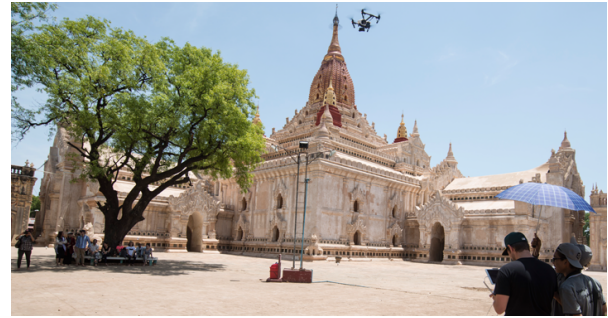
Figure 4: UAS device for mapping a heritage place, Ananda Temple (Bagan), Mario Santana.

This exhibition raised awareness of the impact of war on heritage, therefore meeting the obligation to "support the promotion of public awareness" and "community involvement in cultural heritage conservation" (ICOMOS, 2014).