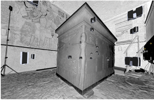
Figure 2: recording the surface of the burial chamber of the Tomb of Tutankhamen using 3D scanning, The Getty Conservation Institute and Carleton University

Following Letellier (2011), CIMS, utilizing appropriate and suitable technology such as 3D scanning and photogrammetry, produced high-resolution ortho-corrected photographic elevations with millimetre resolution and accurate colour correction (see figures 1, 2 and 3).