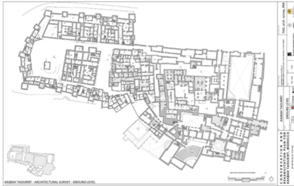
Figure 8: line drawing used for the rehabilitation plan of the Kasbah of Taourirt, result of the recording work, The Getty Conservation Institute and Carleton Immersive Media Studio.

Furthermore, to achieve this as-found record, a combination of image-based survey methods such as photogrammetry and architectural survey methods such as total station was used. These techniques were selected in order to transmit the skills to the CERKAS team utilizing off-the-shelf technology. This aligns with the ICOMOS Ethical Principles "need for capacity building" (ICOMOS 2014) and the Seville principles statement, "heritage recording is a discipline that requires specific training" (International Forum of Virtual Archaeology, 2011).