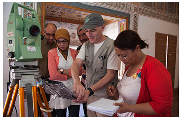
Figure 6: CIMS team training CERKAS experts on recording techniques, The Getty Conservation Institute.

In this project, CIMS developed a recording and capacity-building approach to record the as-found condition of the Kasbah, that would assist in the training of Moroccan experts.