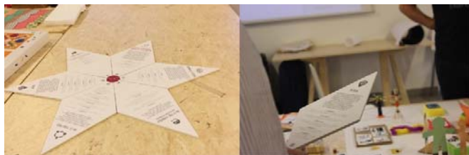
Fig. 3 DiDIY Factor stimuli tool used during the "Make it Real" activity

way, people can add new factors and replace others keeping the tool always up to date. As the six-pointed star concept, the hexagon also gives the same ideas of union in the central part. Only the simultaneous implementation of all factors can generate the desired innovation in digital-enabled projects.