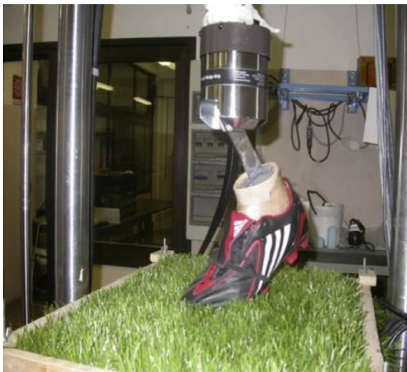
Fig. 3. Experimental set-up used in rotational tests.

These values were defined to reproduce a condition similar to those experienced by players involved in rugby scrums. Tests were performed applying both internal (IR) and external rotation (ER) with support on the tip (Fig. 3), to simulate wheeling of the scrum in both directions. Foot orientation with respect to the ground was adjusted using a 45° angulated platform lying on the ground. In order to assess repeatability of the results, each test was repeated six times, paying attention not to repeat the test on a previously used part of the turf.