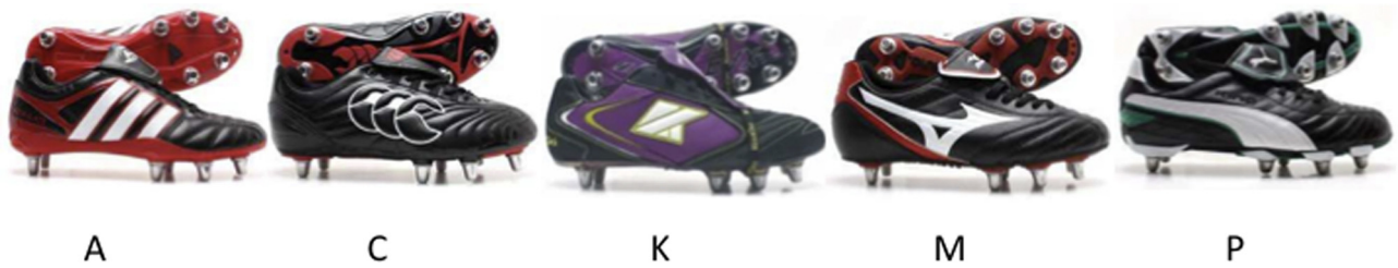
Fig. 1. Rugby shoes models.