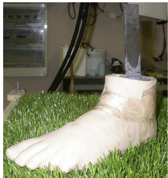
Fig. 2. Artificial foot used in rotational tests.

Tests were performed applying a quasi-static preload vertical force of 1000 N on the foot using the MTS testing machine, than the test was carried out under angular control at a rotation speed of 45°/s, until a maximum angular rotation of 140° was reached.