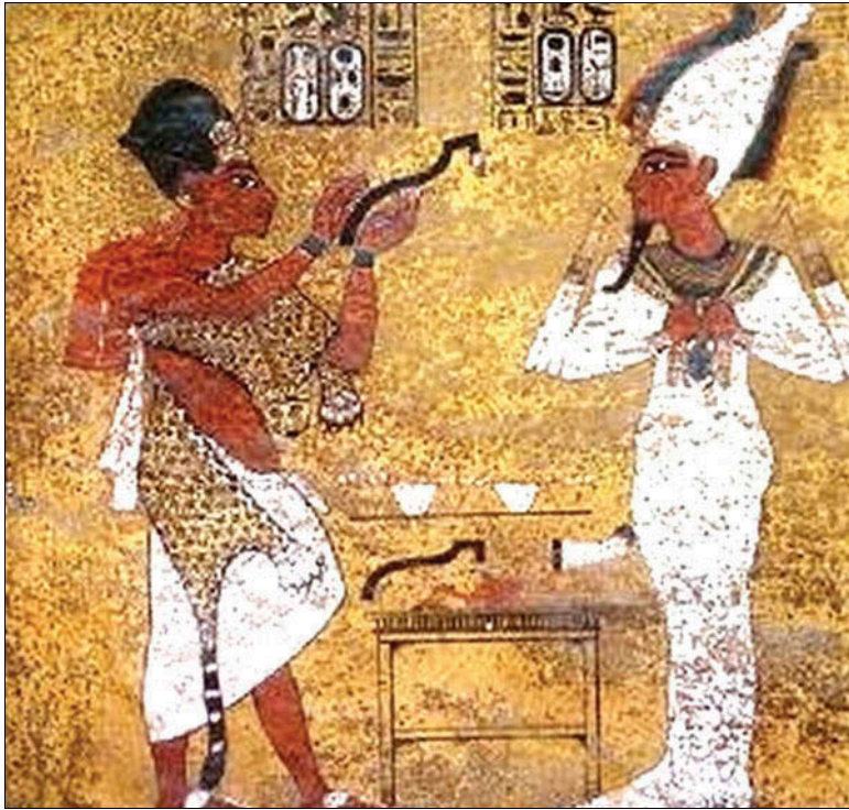
Figure 4. Valley of the Kings. The "Opening of the mouth" ceremony, depicted in Tutankamun tomb.

towards the Nile, but the setting sun at midsummer cannot penetrate the temple, because the horizon is occupied by the Theban hills, which obstruct the view. The astronomical orientation of Karnak to the winter solstice sunrise makes sense, in particular, because this choice must have stemmed from calendrical considerations. Indeed, in the years around the foundation of Karnak the Egyptian "civil" calendar completed one half of its turnaround with respect to the solar cycle, and thus new year's day, started with the summer solstice, coincided with the winter solstice.