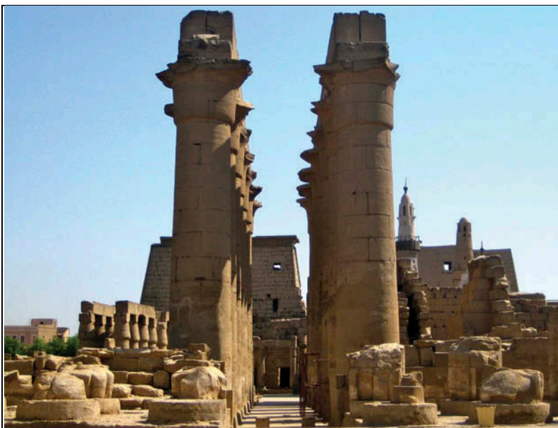
Figure 7. The Luxor temple columnnade seen from the inner court. The visual effect is that of a "standard" Egyptian temple with a straight axis ending in the barque chapels of the gods.

An aura of mystery surrounds the temple of Luxor even today, as countless publications have tried to assign to it a 425 hidden, esoteric meaning. Indeed we do not know the details of the ceremonies that took place there, nor can we imagine the feelings of the devout people who left inscribed votive shards along the route of the statues' procession and saw in the solemn march of the gods 430 the reassuring regularity of the life cycle. After the entrance of the procession into the secluded recesses of