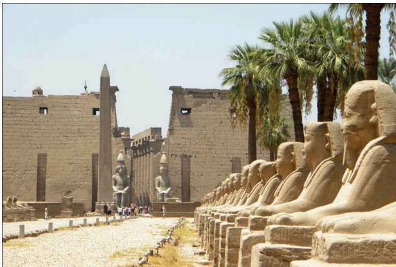
Figure 6. The final part of the Avenue of the Sphinxes and the Ramesses II pylon of Luxor. Notice the macroscopic bend of the axis of the columnnade inside.

of the Luxor temple is documented during the New Kingdom, and actually an ancient quay connecting the Nile with the temple is still visible on the riverside.