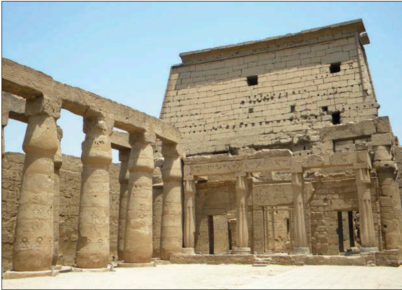
Figure 3. The “barque stations” inside Ramesses II’s court of the Luxor temple.

yearly in honor of the gods in ancient Egypt. It commenced with the Karnak statues being loaded onto ceremonial barques under which long stakes were inserted. Baldachins were then carried on the shoulders of the priests, and the religious procession moved towards Luxor along the above mentioned avenue. At each “barque station” the cortège stopped and the priests performed ceremonies. 2