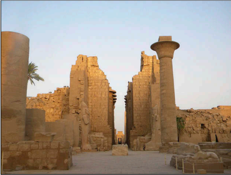
Figure 5. The Karnak temple axis at sunset, near midsummer.