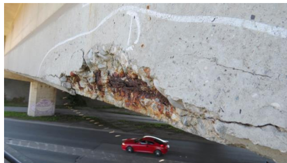
Figure 1. Delaminated concrete cover due to the corrosion of the reinforcement on a roadway bridge 9

Most of the roadway bridges, built before the adoption of modern principles of sustainable planning and seismic design, are approaching to their design lifetime. The volume and loading of the heavy freight vehicles, which they are carrying, are considerably larger than anticipated at the time of their construction. In most cases, these bridges are structurally deficient and degraded due to the aging effects and inadequately maintained (Figure 1). Reliable assessment of their safety to seismic and increased operational loads is therefore required before deciding on their optimal management. 8