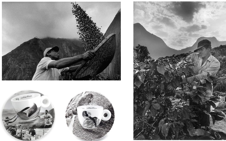
Figure 3: In Principio and illy Art Collection