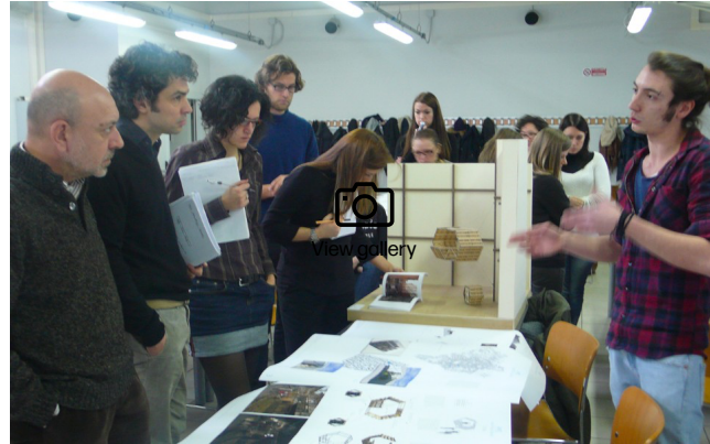
In this gallery: survey after earthquake

conditions which preceded the catastrophe; the contact with institutions, civil society associations, individual citizens; the analysis of interventions carried out and proposals under discussion, all offer initial fundamental information to everyone.