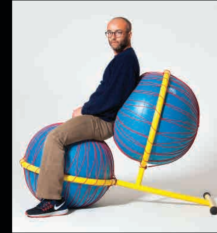
All the images are courtesy of Mario Pagliaro