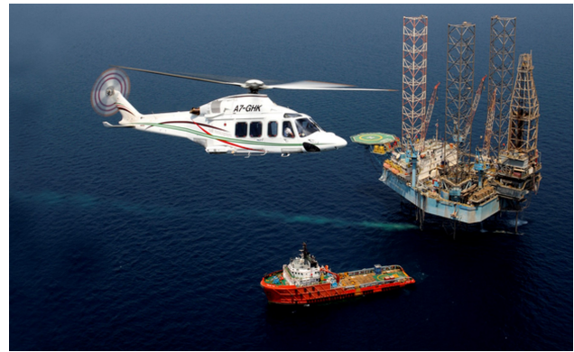
Figure 1: Offshore operation for rotorcraft.