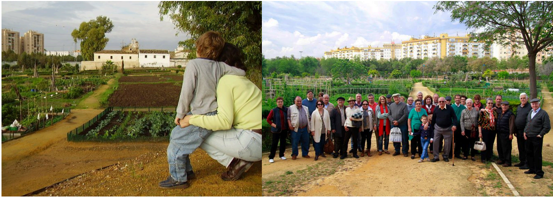
Figures 2, 3: The farm in the Miraflores gardens of Seville (on the left) is listed as cultural heritage and was restored from an initiative of the urban gardeners (on the right).