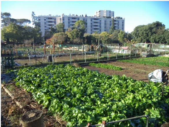
Figure 5: Dated from 1930, Jardin de Mazargues allotment gardens has a high historical and environment value in the Marseille city.