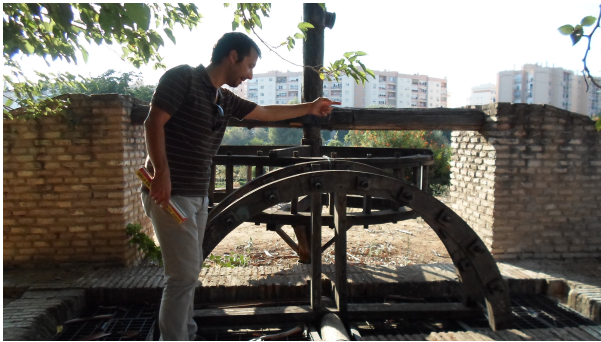
Figure 4: A gardener explains the water mill mode of operation in Miraflores gardens, Seville.