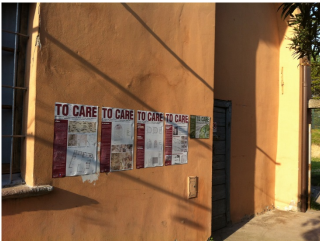
Figure 1: Communication panels describe restoration phases of a fresco rediscovered in the ice keeper (former apse of S.Ambrogio church) in the Terra chiama Milano community garden.

Transmission of intangible heritage in allotment gardens concerns mainly the horticultural knowledge, cultivation technics and appropriate tools, acquired during adolescence or from their parents or grandparents and it is transmitted individually. It can also concern the general historical value of the garden (Jardin de Mazargues, Fig. 5-6). In the community gardens, specific courses (ortotherapy, healing herbs) are provided to members and to the public including the common technical courses. In some recent community gardens ( Huerto del Rey Moro in Seville, Jardin d'Adam in Marsella, Terra chiama Milano at Cascina S. Ambrogio in Milan fund in 2013), sharing the permaculture philosophy is part of the initiation process for obtaining a parcel and it is also a way to check the ability of new citizens to become a gardener and take care of a common space (Fig. 7).