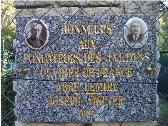
Figure 6: Memorial to Abbe Lemire and Joseph Aiguier, founders of Federation National des Jardins Familiaux et Collectifs en France, Marseille.