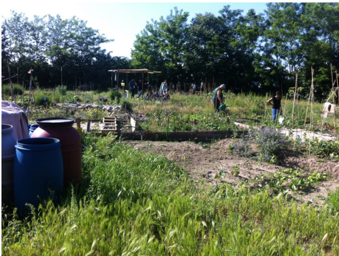
Figure 7: Gardeners participate at the preparatory course in permaculture in the Terra chiama Milano community garden at Cascina S.Ambrogio.