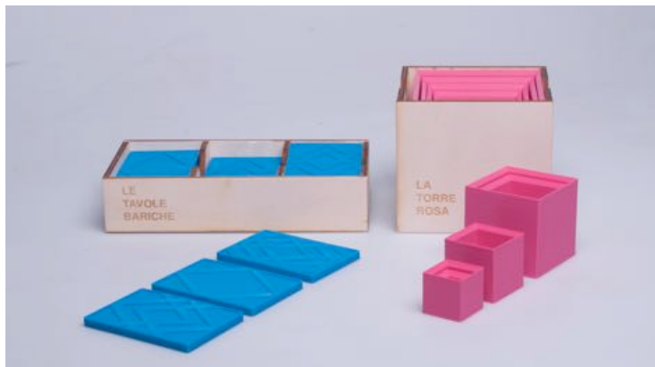
Fig. 5. Prototype of the learning tools for the Montessori Method.

The method uses various wooden objects such as, for example, cubes of different sizes, wooden prisms of variable thickness, bars that differ in length, small coloured tablets - for the associations and combinations of colours -, geometric solids, bi-dimensional geometric shapes, tablets with different degree of roughness, tablets with different weight to develop the baric sense, tablets with bas-relief letters so that children can become familiar with the letter shapes, instruments introducing mathematical concepts such as the Pythagorean theorem and many more.