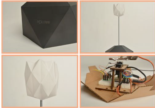
Fig. 6. The Pollenair prototype

colour of the flower. The prototype was developed by using a NodeMCU WiFi board for the acquisition and processing of the real-time data, and for controlling the LEDs and two micro servo-motors used for bending the flower (Fig. 6). Finally, the external structure was manufactured using mainly the laser cutting technology for the basis (made of Plywood, 5mm), while a 3D printing machine was used for manufacturing the main shape of the flower.