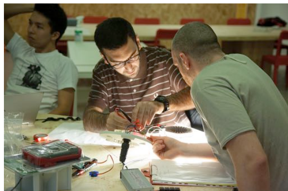
Fig. 2. Students working during the “Design From Ideas To Market” hackathon

The first “stress test” to check the scientific-technical and operational model of Polifactory has been the project called “From Ideas to Market” funded by Regione Lombardia, which allowed the final technological setting of the Lab. The project aimed to simulate and demonstrate how the makerspace can work. A hackathon on interactive furniture has been organized in the new makerspace involving 3 companies and 15 among designers, architects and engineers. The Polifactory scientific team collaborated with 3 companies – Manerba, LuxSolar and Mobilitaly consortium – to define specific design challenges (interactive lighting, interactive living rooms and smart office) and asking them to donate three products (a sofa, a desk and a light) to be hacked by the participants in order to develop new interactive furniture products. The three new interactive prototypes developed during the three days of the hackathon have been presented at the European Maker Faire in Rome in 2015.