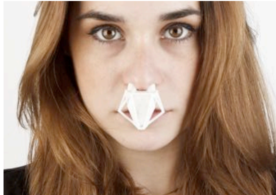
Fig. 4. “Traho” - nasal filter by Renato Ocone, Lucrezia Rescigno, Alice Scaringella. Dimensions: 39 x 22 x 44 mm, Materials: PA 3200, 3D printing technology: Selective Laser Sintering (SLS)

order to guarantee the best performance either to made trick or to run in a city with the maximum control of the skateboards, the three students printed lots of sample to define print direction, slicing parameters, and infill pattern and amount. The hexagonal texture in the inner part identifies Sprinted, between the competitors' wheels, as the unique wheel for skateboard produced by 3D print, and the perforated part guarantees a much lower weight than those currently available on the market.