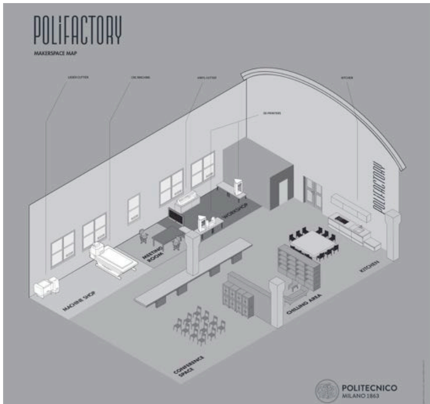
Fig. 1. The Polifactory space

In order to support young talents to improve the level of performance in their autonomous learning processes, Polifactory offers a range of coaching services. By definition, makerspaces are places that stimulate collaborative peer-to-peer and social learning (then the form of peer coaching). Polifactory follows this philosophy providing a coaching service that supports individuals and groups to develop strategic, design, technical-technological, micro and self-entrepreneurial capabilities: