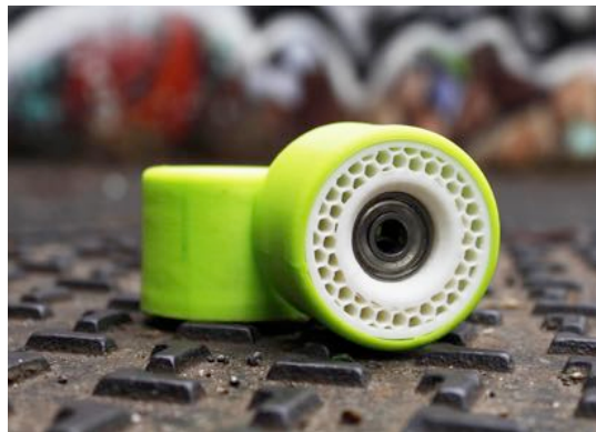
Fig. 3. “Sprinted Wheel” by Carlo Maestri, Alice Mastropasqua, Dario Panico. Dimensions: 52 x 52 x 42 mm, Materials: ABS e Filaflex, 3D printing technology: Double extrusion Fused Deposition Material (FDM)

The two best projects are described below.