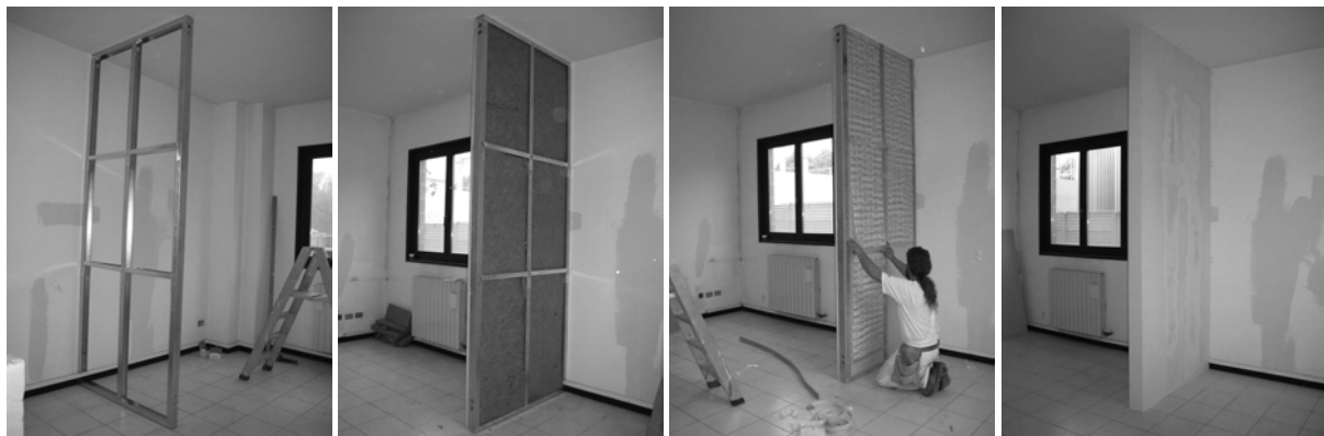
Figure 5: Sample of internal wall board, tested applying layers packaged in blankets containing PCM to provide artificial thermal inertia.

Calculations showed that PCM walls allow for energy savings through reducing HVAC operational time. However if used in a passive way, PCM only facilitates desirable thermal comfort conditions for short periods of time.