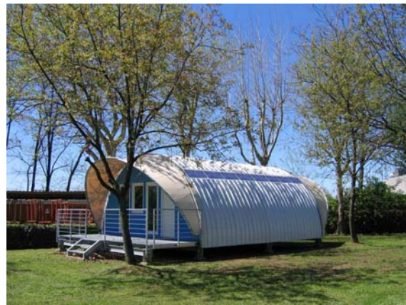
Figures 1-2: On the left, high energy-efficient building in Colognola (BG), Italy. On the right, L'Armadillo, a new industrialized system for light, energy-efficient, permanent and temporary buildings (Atelier2, Milano).