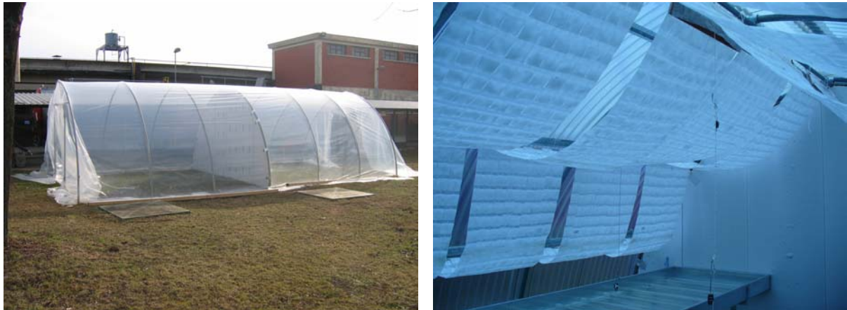
Figure 6: The greenhouse prototype built up in Carate Brianza.

A dynamic numerical simulation was performed on a box built in Verona in the Velux Italia factory using Structure/Envelope techniques. The aim of the experiment was to use PCM as heat source during the winter, increasing the inner temperature and making possible savings for the heating.