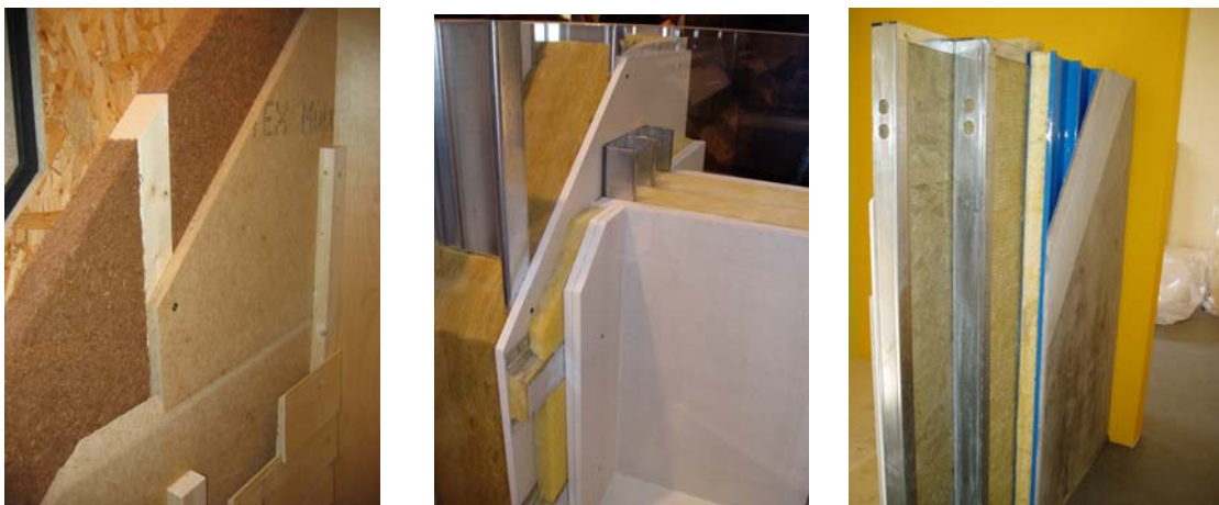
Figure 3: Examples of high-insulated envelope: the last one shows a mix of mineral and wood wool.