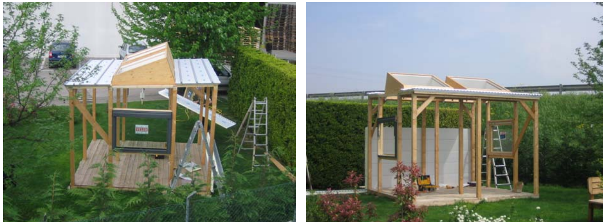
Figure 7 – The box built in Verona with roof windows containing PCM.

The box was divided into two parts: one room with a roof window containing a PCM blanket, one room without PCM blanket. The analysis on the prototype performed on March, April and December, pointed that the inner temperature of the room with the PCM-integrated roof window increases in some degrees, so the PCM could perform as alternative heat sources.