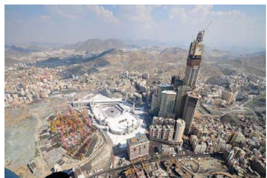
Figure 4. Development of Large-scale projects around Haram