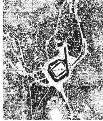
Figure 2. The major Extension of Haram in 1970.