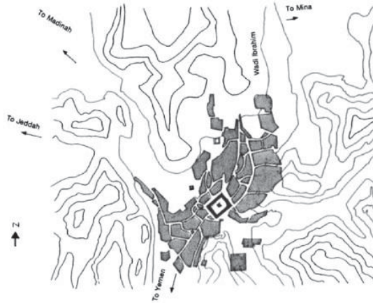
Figure 1. Mecca 1920