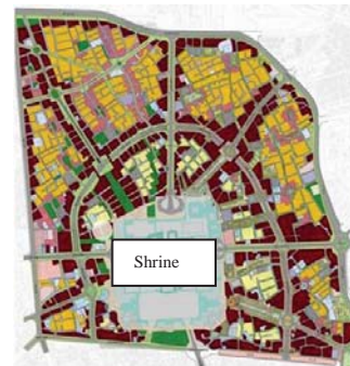
Figure 7a. Separation of shrine from its surrounding by green loop (1970s)