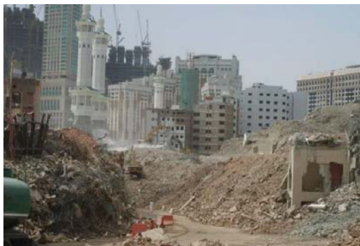
Figure 3. Demolition of historical fabric in Mecca