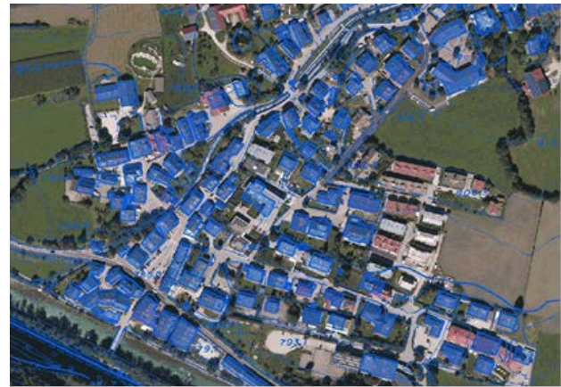
Figure 4. Overlay of the orthophotos corresponding to 1986 data set and the regional raster map at scale 1:5,000, after horizontal shift refinement.

used to this purpose. In Figure 4, the overlap between a portion of the orthophoto produced from photos dating back to 1986 and the regional raster map is shown.