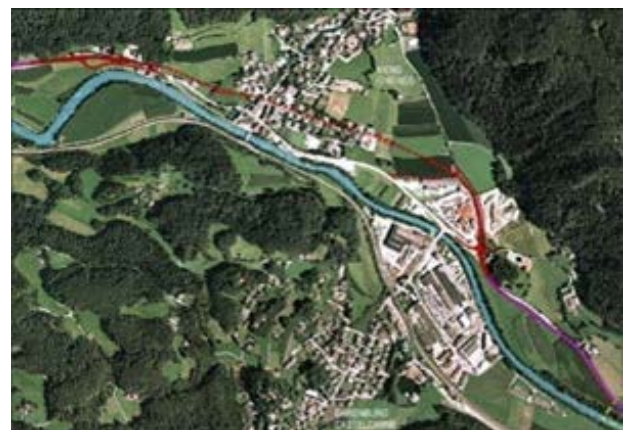
Figure 3. The longitudinal axis (red line) of the new tunnel to by-pass the village of Kiens/Chienes.

Since the main growth of the urbanization in this area has developed during the last 50 years, a decision was made to do a preliminary analysis of topographic and cadastral maps, as well as the available archive photos dating back to that time. It has to be highlighted that this analysis of existing or newly-produced topographic data did not replace geotechnical in-situ investigations, but it was afforded only to figure out the possible presence of unknown problems, to be better focused in a following stage with local reconnaissance.