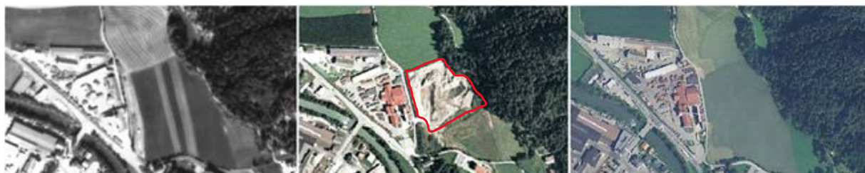
Figure 7. Patches from orthoimages (from left to right: 1986, 1995, 2006) depicting a portion of the territory of Kiens/Chienes in correspondence of polygon ID= 223 (in red on the central patch), where a covered former open pit has been found.