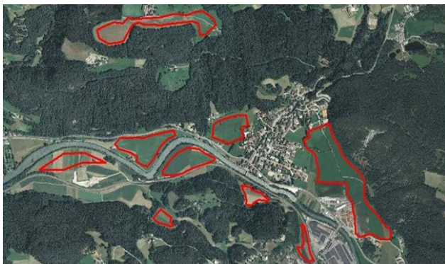
Figure 5. Regions where comparing the photogrammetric DEM's to the LiDAR DTM.

electric poles, etc.), some differences in each DoD may depend on this fact. Consequently, this analysis has been bounded to those areas made up of bare ground. In Table 6 the results on three of these regions are shown in term of average elevation differences. In general, a reduction of the absolute values of the mean differences (in the rightmost column of Table 6) may be noticed, especially in Regions 1 and 3. This finding may be mainly due to the quality of the photographic material, which is expected to be lower in the older data sets. The different photo scales may have also had influence, according to the relative flight heights reported in Table 4. In Region 2, the progressive reduction of the mean differences could be due to some ongoing excavation process. A visual analysis of the orthoimages in the corresponding periods has not confirmed this assumption. Consequently, this behaviour cannot be assigned a specific reason, but it may be due to the effect of random errors as estimated in Table 5. On the other hand, the results of the analysis on the ‘Test block’ reported in Table 2 also enhanced a non-homogenous behaviour of the differences within the study area.