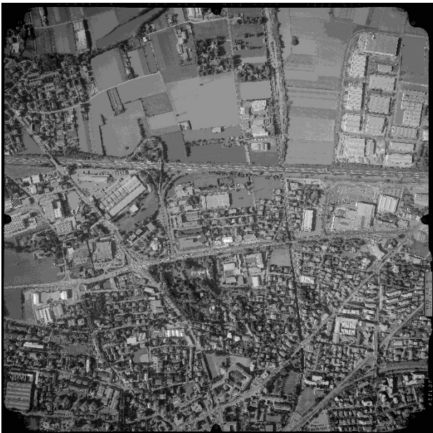
Figure 1. Example of an analogue photo with eight FM's captured with a Wild RC30 airborne metric camera. This image is included in 'Test block' described at the beginning of Section 3.

The use with digitized old aerial analogue photos is not directly encompassed in the most low-cost photogrammetric systems, which have been designed to work mainly with close-range and UAS projects. As it can be seen in Figure 1, an analogue photo has a framework reporting data about acquisition time, adopted camera and lens, temperature, and 4-8 fiducial marks (FM - see Kraus, 2008). In particular, FM's are used for correcting residual film distortions that may have developed during the conservation of the analogue support, for example. The typical size of these distortions may be approximately few tens of micrometres after a few decades, depending on somehow the film has been archived. FM's were concurrently used for establishing the photo reference system, which is centred in the middle of the frame.