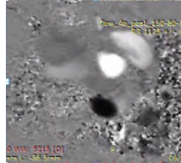
Figure 2. Example of the acquired delta phase in the head-to-foot direction for the aortic cross-sectional plane at position 1.

As part of the European Space Agency (ESA) HDBR