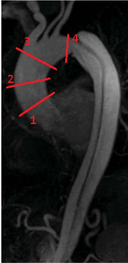
Figure 1. Longitudinal scan of the aorta with highlighted in red the cross-sections in which PC-MRI has been acquired

assessment in a specific cross-sectional plane by the acquisition of MRI magnitude complemented by three modulated gradients inducing phase offsets between \pm \pi to moving protons [5]. Their motion is then encoded into velocity data along three orthogonal directions, thus generating a full 4D velocity-map (3D spatial + 1D time) of the specific anatomical cross-section of interest. Accordingly, our hypothesis was to study aortic flow and morphology using phase-contrast magnetic resonance imaging (PC-MRI) during HDBR. In addition, the effectiveness of a novel sledge jump system countermeasure was evaluated.