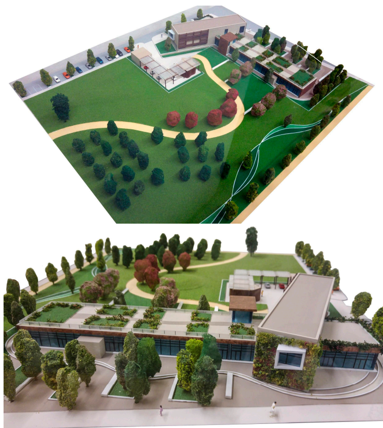
Figure 2. Physical model of the design project of the Milan Smart City Lab. The building is now in the executive design phase, while the open space still do not have a defined design project.

In the course of Architectural and Urban Simulation we tested the use of such an approach with the class. Students from the courses of study of architecture and planning developed a design project for the open area behind the Smart City Lab of the Municipality of Milan , in via Ripamonti 88, that will be built in 2018 (Figure 2). This will be a new public facility located in the south Milan, that will mainly host temporary co-working activity and will be an incubator for startups dealing with smart and sharing city solutions. The Smart City Lab and its open space will cover a total area of around 2 Ha; since this is a public facility, students were allowed to conceive the entire land as a public service.