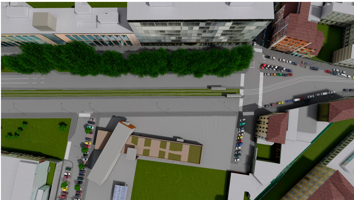
Figure 1. Render of the 3D model provided to students.

photographs of the existing buildings' facades, and later we imported it into the rendering software Lumion® by Act-3D® (Warmond, The Netherlands, EU) for the texturing and rendering of the final visualizations (Figure 1). We decided to use this tools because they are easy to learn and to use despite enabling high quality results in a short time. The limit of this choice is mainly related to the visualization style of Lumion®, that is peculiar and recognizable and produces visualizations that are too clean and pleasant. The modification of this fancy style is difficult to avoid, and this of course can incur a sort of bias if abused. For this reasons we tried to control this effect and we embedded the styles in the model as a reference for students. With this software it is very easy and fast to save spherical panoramas that can be presented using an HMD. Even in the choice of these devices we followed the same strategy as for software; we used cheap Cardboard where it is possible to insert smartphones of different sizes for visualizing the simulations in an interactive way. The same panorama produced for HMD can be visualized and navigate directly in the browser of the desktop pc or of mobiles. It is important to remark that the use of this tools has been intended as iterative to support the typical non-linear design process (for more details on the approach adopted see [3]).