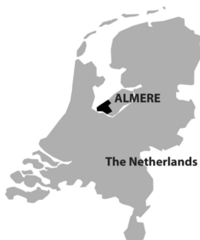
Figure 2: The location of Almere in The Netherlands

One of the Dutch municipalities trying to organize for “organic development” is Almere. Almere can be seen as an interesting example of moving from one side of the spectrum to the other: from the blue-print approach to more spontaneous development (Cozzolino 2015a). The city is an “extreme case” (Flyvbjerg 2006) of the change in Dutch planning and development. Almere is situated approximately 30 kilometers northeast of Amsterdam. The city was