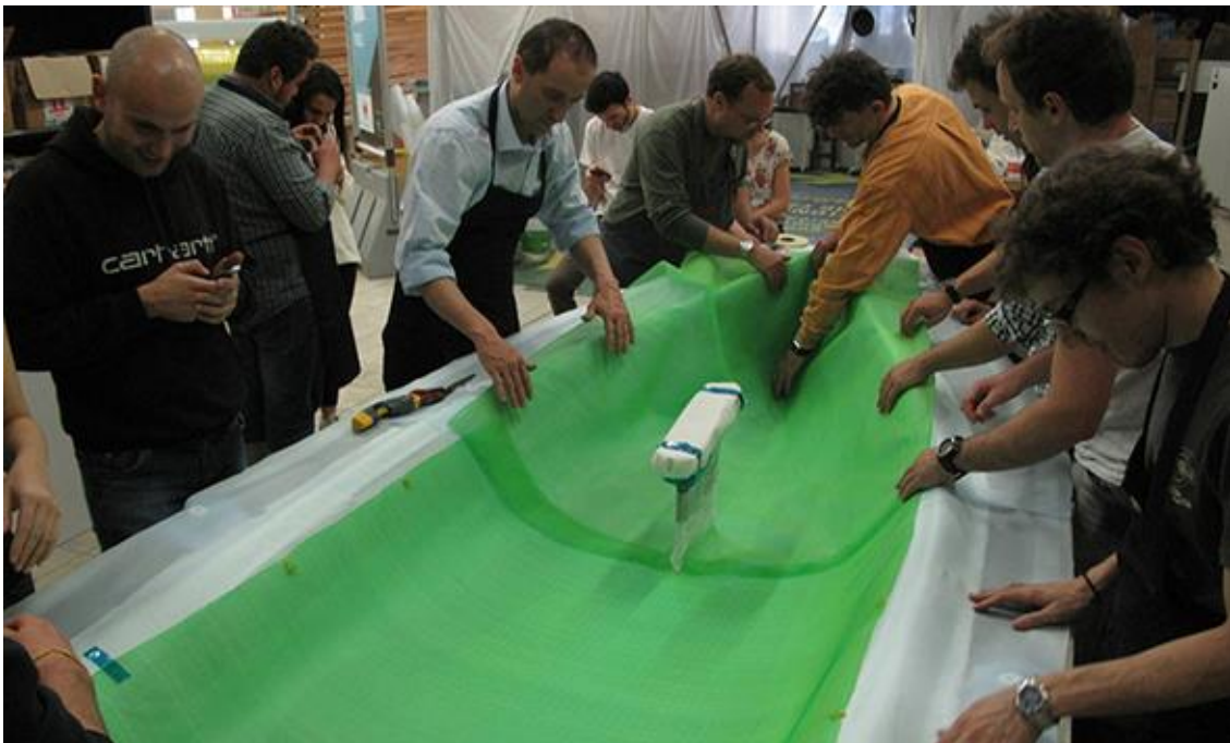
Fig. 13: Moulding work of a real-size sailing boat with the students.