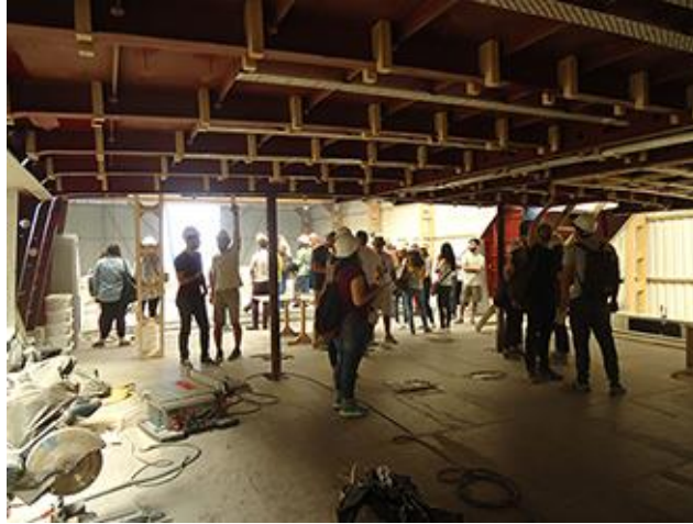
Fig. 3: A boatyard visit of 2015-2016 Spring in Bodrum