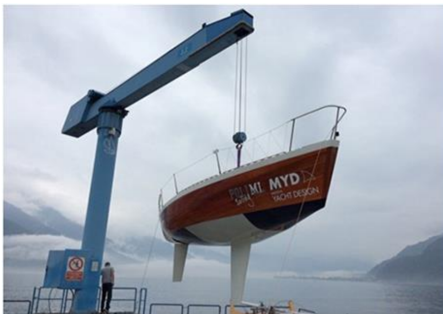
Fig. 20: After the application of films, the boat is lifted down to Como Lake.

Results are divided as defined by the test protocol: a. apply on double-curved surface, b. adhesive power of the films in water, c. quantify and qualify the biofouling growth on samples and d. possibility to clean the samples. The tests provided an experimental confirmation on different parameters which are considered relevant in the biofouling prevention research. Results led the team to explore the following areas of investigation. Film surface design: characterization of the film coating with different surface texture. It is considered appropriate to run a comparative effectiveness study to evaluate the antifouling effect of different surface textures taking into account the academic research on micro and nano-topography (Ratti, Bionda, 2016). Frictional resistance of rugged surfaces: verification of the potential increase of the resistance induced by different texture sliding into water. The test will be carried out by naval basin experimental method on flat sheet samples and hull model samples. Integration of antibacterial compounds: integration in the film chemical formulation, of antibacterial compounds with different active ingredients as well as deducing from the literature and from the other areas of application (Fig. 20).