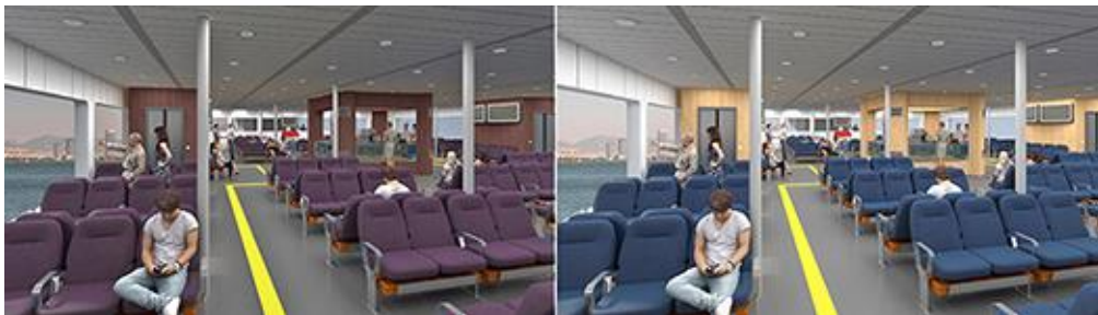
Fig. 2: Two colour options of the passenger deck interior for Ceksan shipyard's ferry project.

Computer Laboratory is widely used by the students who take Computer Aided Design of Yachts and Yacht Design Studio II courses. Both courses are in timing and content correlation, once the preliminary design has been completed in the studio and since the students have a 3d model of the boat in Rhinoceros software, it is roughly tested in Maxsurf software in computer course and the results then the revisions are discussed by both course instructors in the studio. Students go on working in the computer laboratory to develop the styling and interior design using mainly 3ds Max and Adobe Photoshop software. Design problem may vary depending on the project demanded by the industry. Interior design of the passenger deck of a ferry was the Ceksan shipyard's need and was the studio project of 2014-2015 academic year fall term. Within the scope of studio work, material, colour and texture options, furniture, equipment and lighting fixture choices and other details were discussed with the company authorities on the perspective views prepared by the students (Fig. 2). The project was including the disabled accessibility solutions as well, so, the diagrams have been drawn to show each solution at every step of accessing to the passenger deck from the port. This was beneficial for the students to work on a real case and for the shipyard to develop their experience in accessibility.