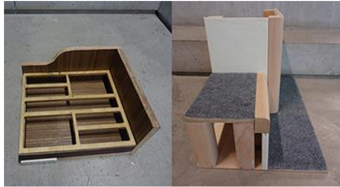
Fig. 10: Two study models, left is a kitchen accessories holder, right is the step next to a cabinet.