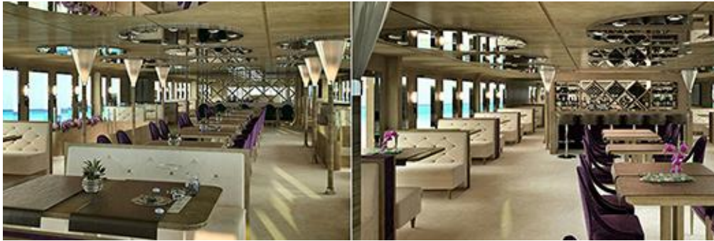
Fig. 6: Perspective views of the upper deck, right one to the bar, left one to the back of it.