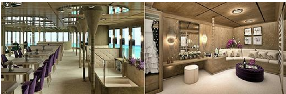
Fig. 7: Perspective views, left to the aft on the upper deck, right from the bride room on the lower deck.