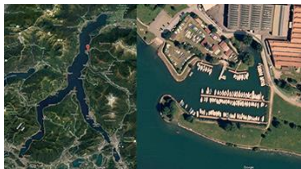
Fig. 16: Location of the boat: Porto di Santa Cecilia in Dervio.

The entire research activity is developed in 30 months and is organized in four steps: a. preliminary research and test of self-adhesive films developed for different use and compared with antifouling products on the market to define the state of the art, strategies and scenarios, b. definition of the chemical, physical and surface films properties, laboratories and in situ tests, c. product and processes engineering and d. final test on a statistically significant sample of boats. Products already adopted in other application areas, such as anti-graffiti films used in railway transport and protection films developed for landscape architecture and urban furniture are first considered. The study evaluate the adhesive and antifouling properties of the different wrap materials and their capability to resist in the new ecosystem through laboratory and in situ tests. The self-adhesive film products already available on the market has been carried out in collaboration with private sector companies working in this field. Film A is a repositionable self-adhesive flocked PVC, film B is a transparent PVC self-adhesive, film C is a transparent polyurethane self-adhesive, film D is a transparent PVC self-adhesive, film E is a transparent PVC self-adhesive resistant to UV rays and abrasions and finally the antifouling paint (AP) is a hydrophilic self-polishing paint with carbon additive (Fig. 16, 17, 18).