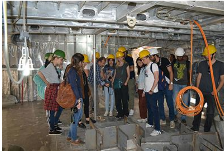
Fig. 14: A boatyard visit with the master students.