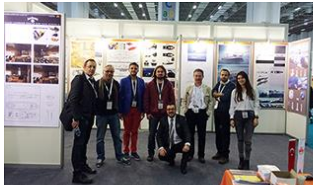
Fig. 4: Student projects fair stand in Izmir Boat Show of April 2015.

Fair participations are essential to exhibit the student projects not for the public only but for the producers, material sellers, marinas, institutions and operators also. Since they are suitable platforms to establish new contacts, besides the participation, national and international boat show visits are organized. Thus, every year at least one fair is visited or participated like Izmir Boat Show and CNR Avrasya Boat Show as national and Dusseldorf Boat Show as international. A 12 meters long remote controlled catamaran project had been put on the agenda in Izmir Boat Show of 2015 (Fig. 4).