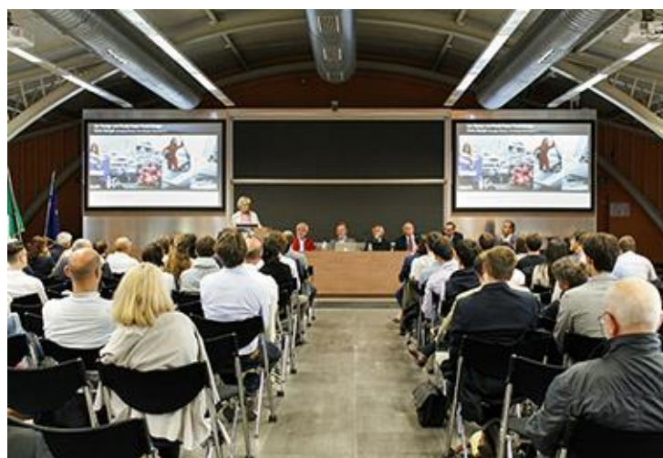
Fig. 15: Italian Yacht Design Conference in Campus Bovisa in 2016.

Many seminars have been organized or participated in, from now to backwards such as Italian Yacht Design Conference on June 16 in POLIMI in 2016 (Fig. 15), Nautica italiana investe sui nuovi talenti: MYD Graduation Day of April 13 in Fiera Milano-Rho in 2016, Criteri progettuali e strumenti per l'ottimizzazione dell'assetto e della stabilità del diporto on October 22 in POLIMI, Campus Bovisa in 2015, MYD e POLIMI Sailing Team conquistano il Trofeo PAOLO PADOVA of September 17-20 in Rimini, Club Nautico in 2015, Seatec of February 4-6 in Carrara in 2015, The Foiling Week of July 8-10 in Fraglia Vela Malcesine, TFW Forum in 2014, Navi Pirata: scopri i segreti della vita di bordo of April 12 in POLIMI, Campus Bovisa - Lab. Allestimenti Paolo Padova in 2014, Costruire una barca?... un gioco da ragazzi! of April 6-7 in POLIMI, Campus Bovisa - Lab. Allestimenti Paolo Padova in 2013, Sistemi Innovativi di propulsione e trasmissione per applicazioni nella nautica da diporto of June 3 in POLIMI, Campus Bovisa - Aula F.lli Castiglioni in 2013, Open Lesson - Yacht Design / Trend e nuovi segnali of June 30 in POLIMI, Campus La Masa - Galleria del Vento in 2013 and 10 Anni di idee per la Nautica of September 30 in POLIMI, Campus Bovisa - Aula F.lli Castiglioni in 2011. The list goes back to 2003 and thus, many others could have been listed here but the sum of all indicates that the master program is in close contact with the boat community as well.