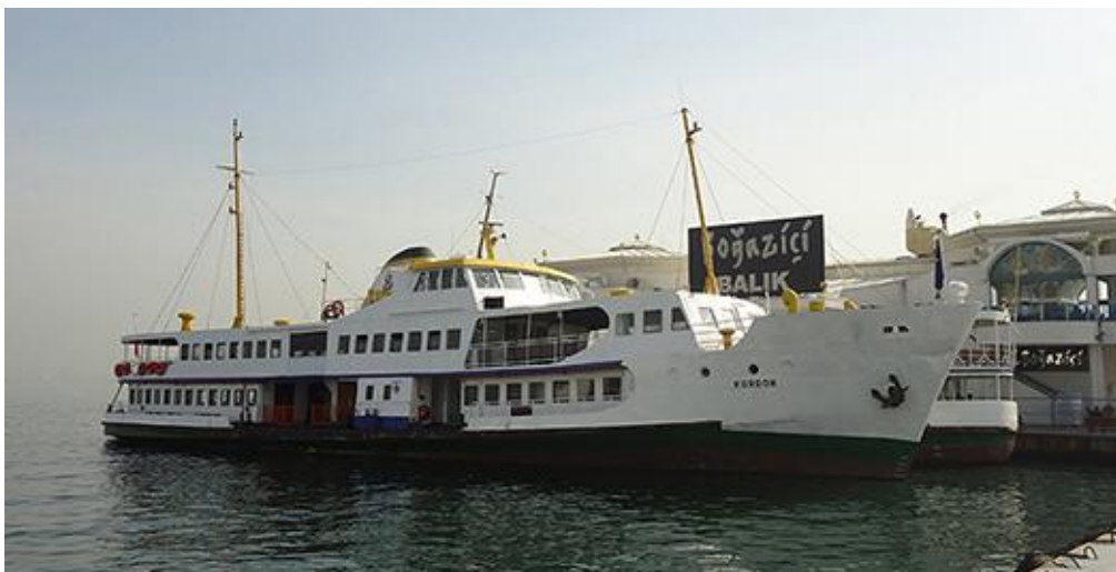
Fig. 5: Kordon passenger ship, a 50 meters long boat designed in 1986.

As usual the beginning was to visit the boat with the students and taking the photos and measurements of existing situation since the drawings of 1986 are hand drawn and copies are not useful enough (Fig. 5). A brief on technical information and space requirements have also been given by the experts and administrators of institution. Then a proposal with many options of layout was prepared and the ambiance of interior was presented on perspective views in a series of meetings with Izdeniz. Students were involved in this process of work actively either with drawing and modelling the boat or with participating the meetings and discussed the new details and joints with the captain and his team and naval architects.