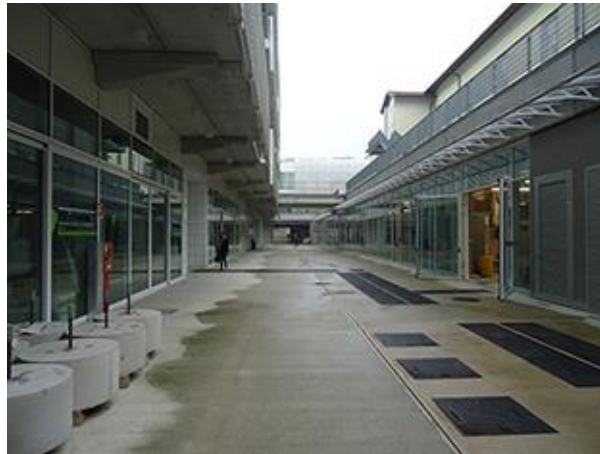
Fig. 11: Laboratories around the courtyard in Lecco Innovation Hub.