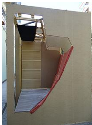
Fig. 1: A partial model of the master cabin of a 26 meters long motor boat.

Model Making Laboratory of the university has two parts, hand tools are in the first and power machines like table saw, planar and drills are in the second part which is useful more for the wooden construction and furniture making. After the two weeks training period on how to use the machines and safety regulations by a technician, students start to work in the laboratory under his guidance. They built a part of master cabin on the lower deck at the bow of a 26 meters long motor boat in 1:1 scale in Interior Materials, Components and Applications for Yachts course in 2015-2016 academic year spring term. It was a refit project's study model and provided a feedback to the boatyard to change the cabin height and also colour and texture of the materials on the floor and partition wall (Fig. 1). Students do work in the laboratory for the study models of their studio project as well. This helps them to understand the structural elements of a boat and to develop the experience of working with wood which is an essential material for the interior space construction in custom tailored boat production.