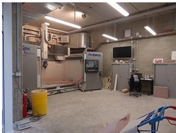
Fig. 12: Five axis CNC machine in Prototyping Laboratory.