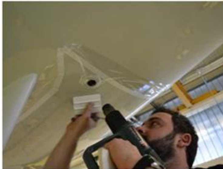
Fig. 18: Film application to the hull surface of the boat in the laboratory.

Source: Ratti, A., Bionda, A., Antifoul - Wrapping Final Report, Lecco Innovation Hub, 2016.