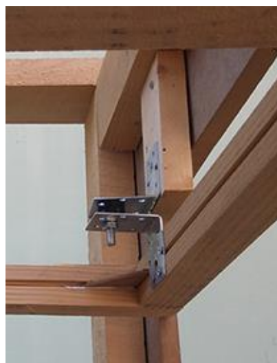
Fig. 9: Study model of the joint detail.

According to the envisaged workflow, at the beginning of construction, all furniture, doors and windows, floor and ceiling coatings and frames are removed. Then cutting and welding is done for the changed parts: removals and additions. And then sanding, pasting and insulating besides the pipelines and trays for the electricity and mechanical systems are applied. When it comes to the fine works: interior cladding and partitions, a solid wood framing is constructed on which marine plywood sheets are stapled as a base and onto the base, one more plywood sheet which is wood veneered is mounted as it is done in all luxury yachts. And as it is known, the frames are connected to the structure of the boat by using special shock absorber fixtures. This system with the fixtures is also used for the ceiling structure but cannot be used for the flooring since it is a load bearing surface. Therefore, the vibration can be absorbed on the walls and the ceiling but not on the floor. Sure there are very thick marine plywood sheets, which a rubber layer in, to be used as a base on the floor but it should be mentioned that it does not absorb the vibration as much as the fixture can. So, briefly, the same joint detail has been adapted to the floor in different size and shape (Fig. 9, 10).