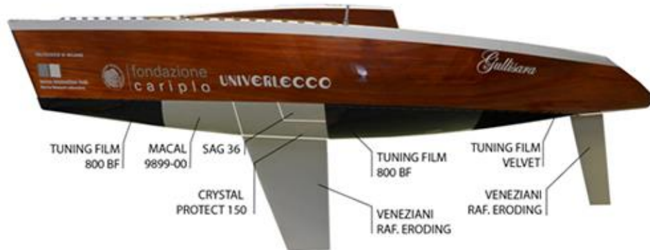
Fig. 19: Reference diagram to place the product samples on boat hull.