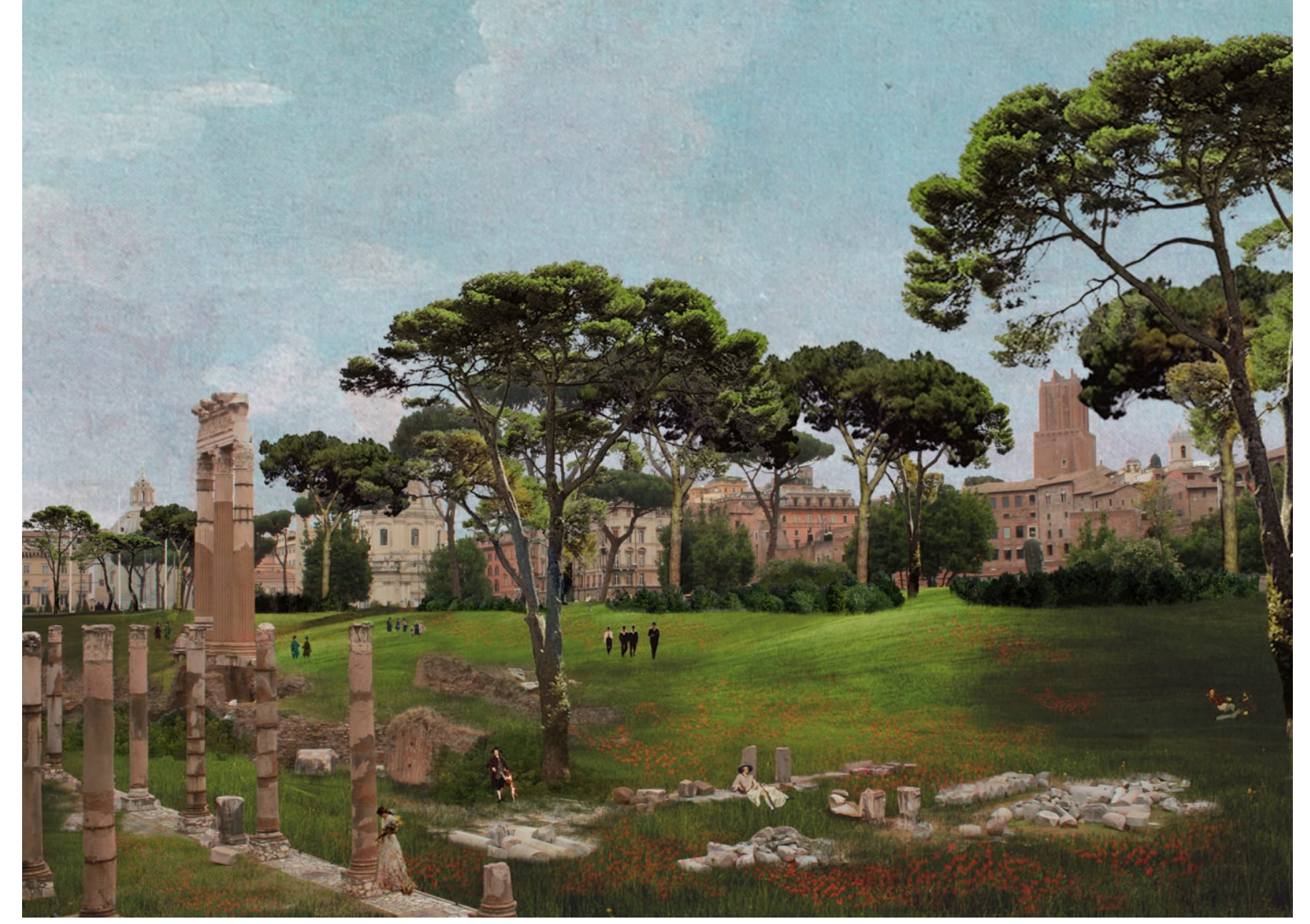
(/projects/325072/images/5479213/zoom) © DAVID CHIPPERFIELD ARCHITECTS, ALEXANDER SCHWARZ