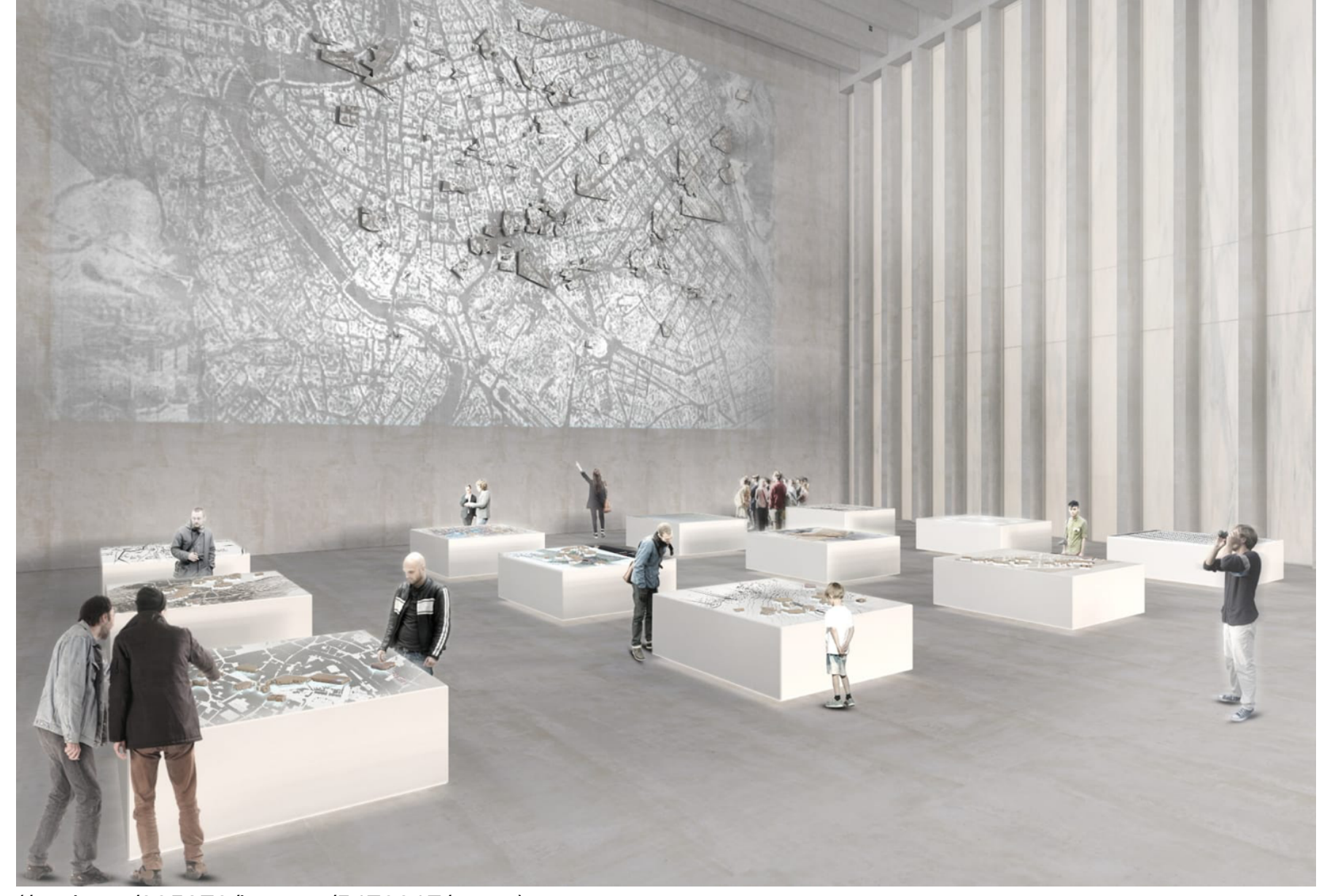
(/projects/325072/images/5479217/zoom) © DAVID CHIPPERFIELD ARCHITECTS, ALEXANDER SCHWARZ