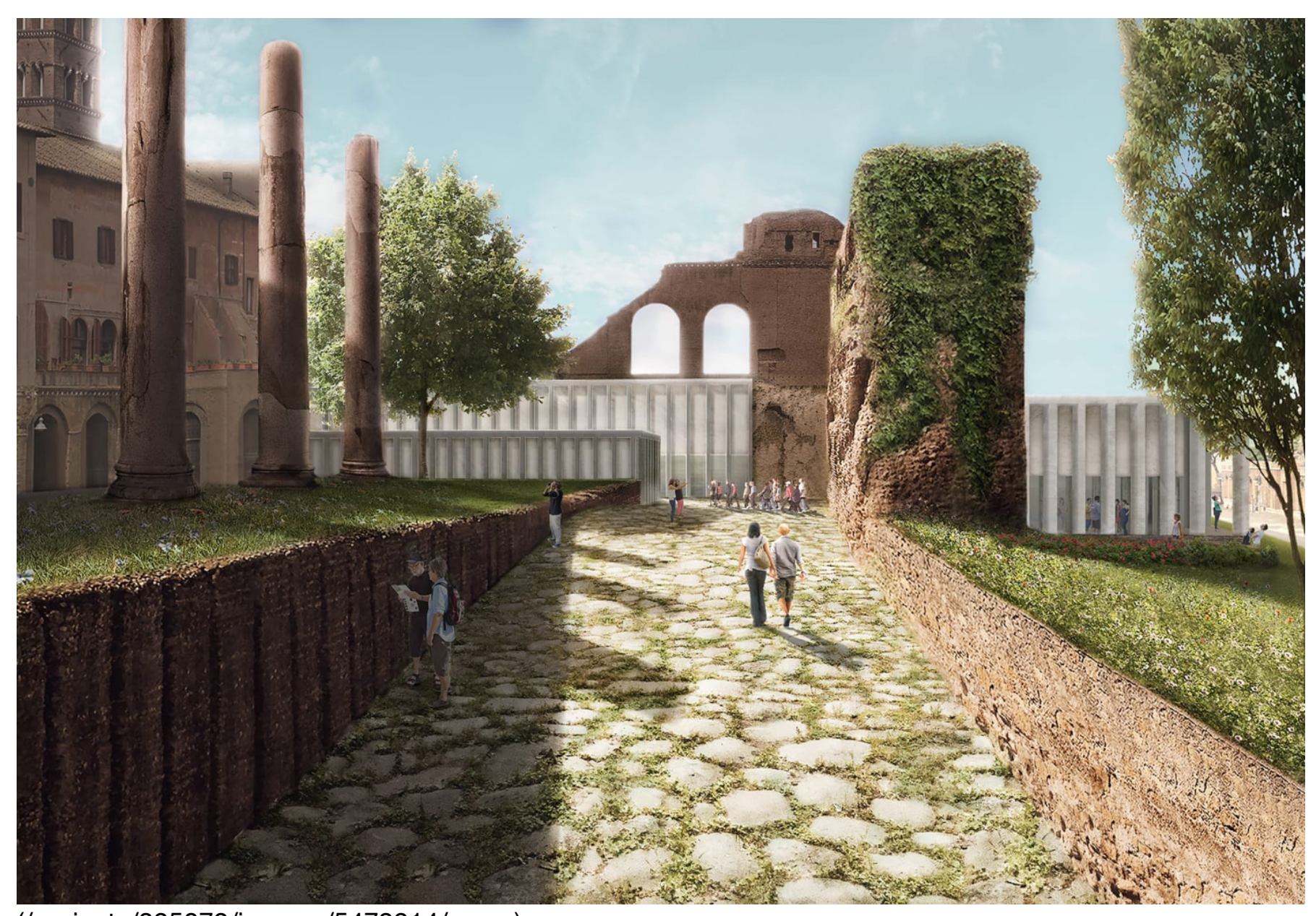
(/projects/325072/images/5479214/zoom) © DAVID CHIPPERFIELD ARCHITECTS, ALEXANDER SCHWARZ

The new architectural interventions concern: the principal entrance and the facilities in the Basilica di Massenzio, the belvedere on Antonio Cederna terrace and the Antiquarium Museum on the Ludus Magnus.