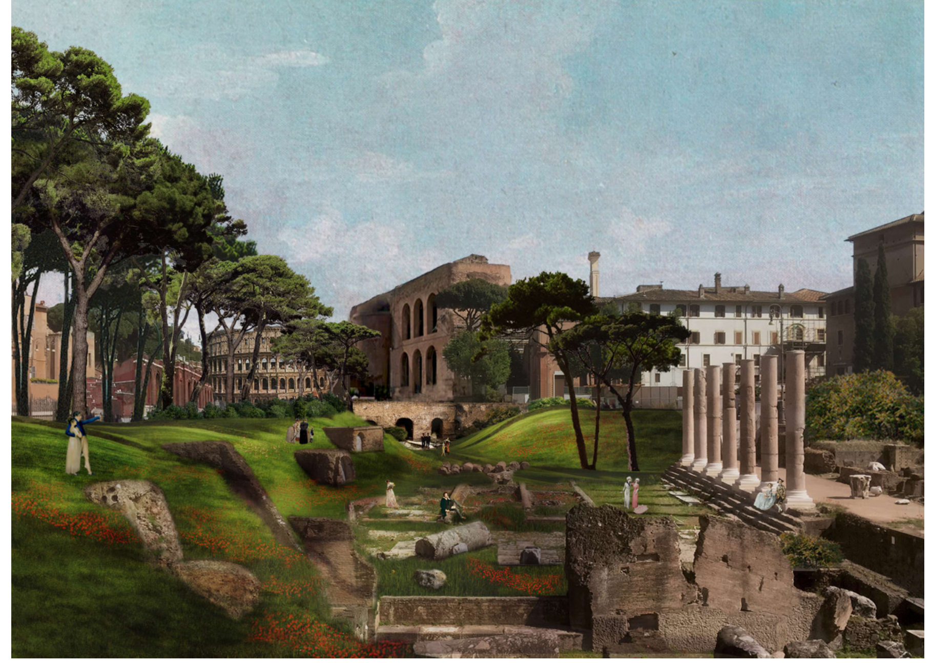
(/projects/325072/images/5479216/zoom) © DAVID CHIPPERFIELD ARCHITECTS, ALEXANDER SCHWARZ