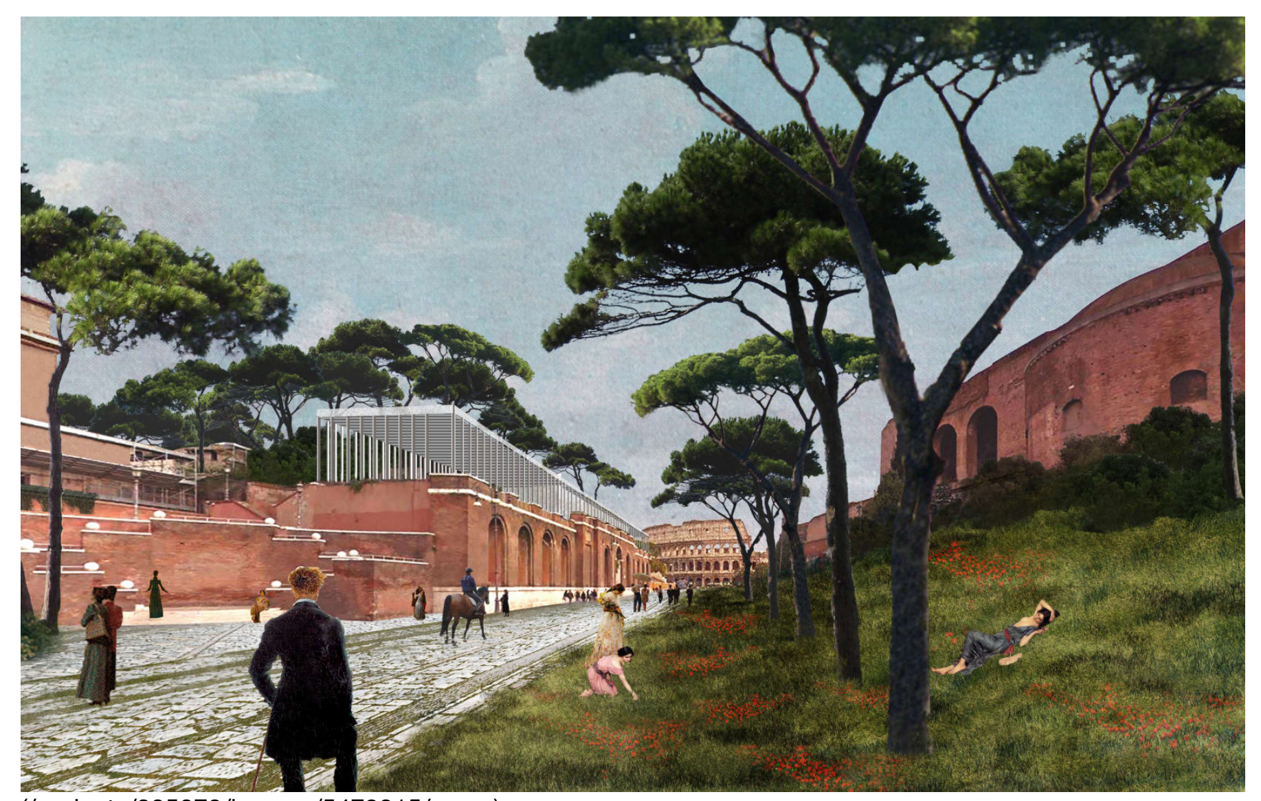
(/projects/325072/images/5479215/zoom) © DAVID CHIPPERFIELD ARCHITECTS, ALEXANDER SCHWARZ

Winner of Piranesi Prix de Rome 2016 XIV Edition, competition for via dei Fori Imperiali in Rome.