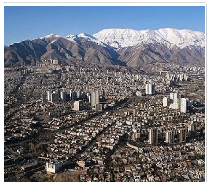
Figure 1: This image shows a view of Tehran in a clear sunny day.

The SCATS Philosophy is based on real-time enhancement by using many distributed computers as processors. Although it has libraries of offsets, phase split plans, no comprehensive, reliable plan can be defined. Instead, different plans should be checked and selected for the application to advanced cycles. SCATS is not model-based. It relies on incremental feedbacks. Intersections can be grouped as