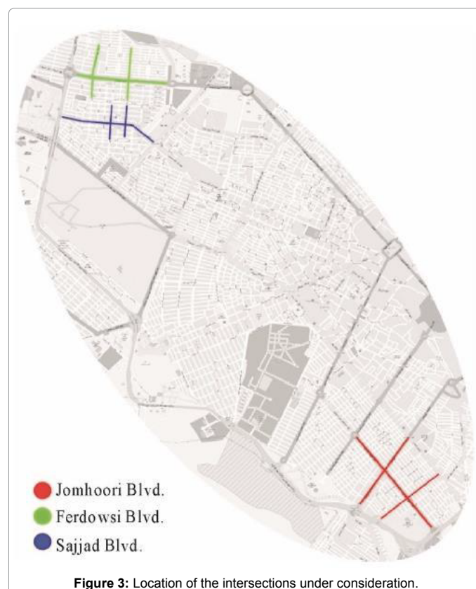
Figure 3: Location of the intersections under consideration.

The urban traffic control system SCOOT, which is the acronym of “Split Cycle Offset Optimization Technique”, was developed within a collaboration between Transport Research Laboratory (TRL) and UK traffic systems suppliers [4]. Peak traffic Ltd, TRL Ltd and Siemens