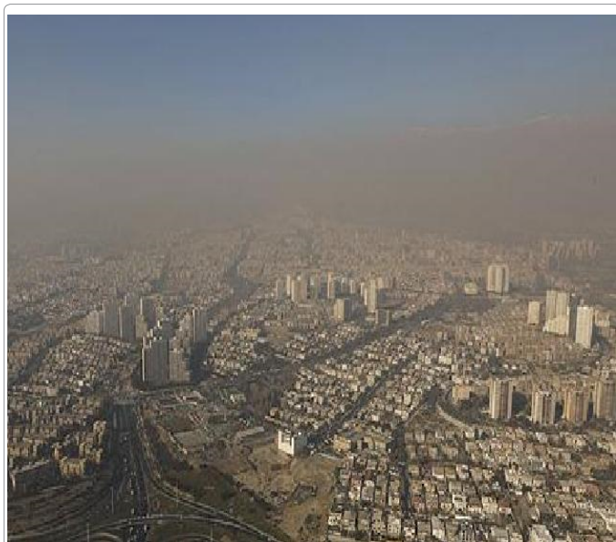
Figure 2: This image shows air pollution in Tehran from the same point of view.