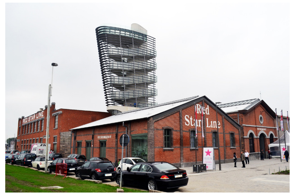
Figure 3: Red Star Line Museum

The architectural context of the museum complements the visual communicative apparatus of these exhibitions and further amplifies their poignancy. Migration museums are in fact usually located in places that have a history related to migration, such as port cities, docklands, border or departure towns, and areas which have suffered intense migration flows. Moreover, whenever possible, the building hosting the museum is a very emblematic building, connected with stories of migration and bearing itself a memory of migration. Beside the widely known and paradigmatic example of the Ellis Island Museum, amongst the European cases it is worth mentioning the Red Star Line Museums, located in the neighbourhood of the old port of Antwerp, in the former premises of the Red Star Line, a shipping company whose activity was largely based on the profitable transport of emigrants from Belgium to Canada and the United States. The museum comprises three original warehouses originally devoted to medical examinations, administrative checks and luggage disinfection, which have been renovated while preserving their original Art Deco architecture and decoration. Another example is represented by the Museum of the History of Immigration in Catalonia, in Barcelona, where a section of the exhibition is set up on the carriages of the El Sevillano train that were used by migrants who moved to Catalonia from the south of Spain during the twentieth century.