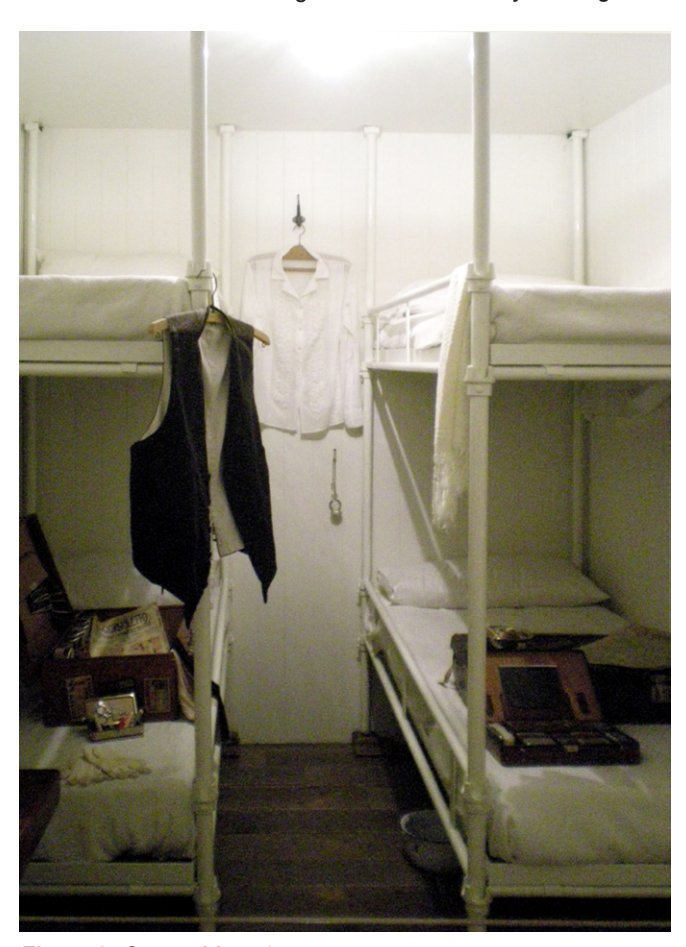
Figure 2: Genoa Mem 1

Most emigration museums and galleries include such spaces. To mention a few examples: the gallery Titanic, return to Cherbourg at La Cité de la Mer in Cherbourg, includes a large section devoted to emigration, developed, as the whole exhibition, with a wide use of reconstructions, interactive devices, audio and video testimonies and even holograms; and the exhibition about Italian emigration MeM—Memory and Migration at the Galata Museo del Mare e