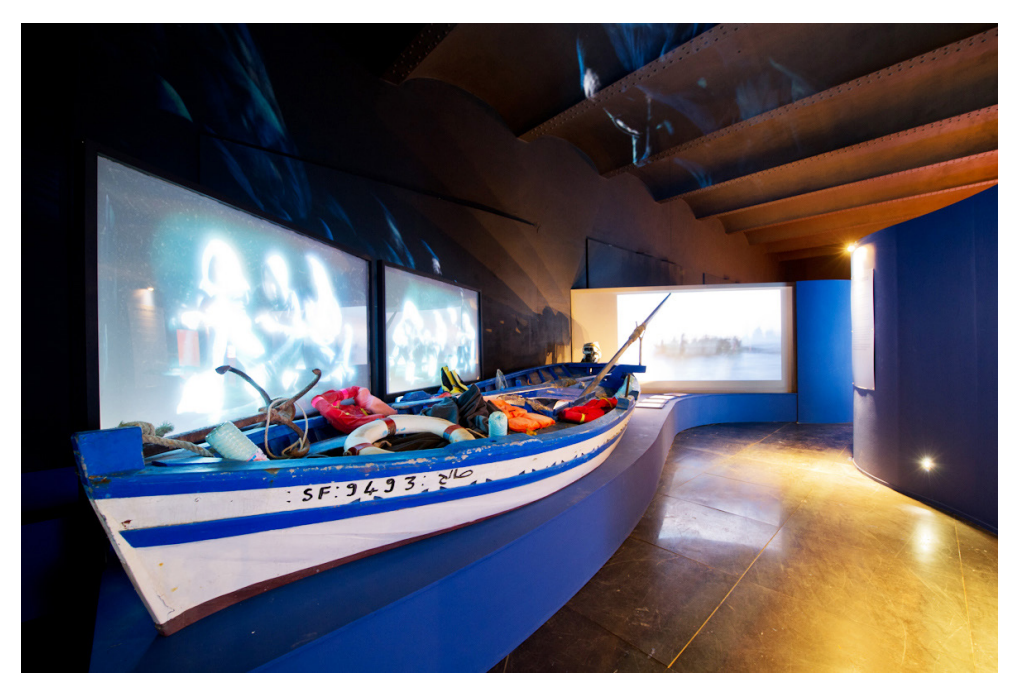
Figure 5: Genoa Mem 2

Other displays require the visitor's interaction to activate the contents focusing on different topics and aimed at recounting rough stories of migrants, the hardship of their travel to Italy while highlighting and refuting stereotypes and prejudices about immigrants and their impact on Italian society. Period rooms and reconstruction are not pervasively present any more, and role-play dynamics do not structure the visit any longer. The exhibition always aims to nurture empathy in the visitor through the stories that are told, but also – and more explicitly – to raise questions and foster reflection on the issues that the exhibition investigates. For