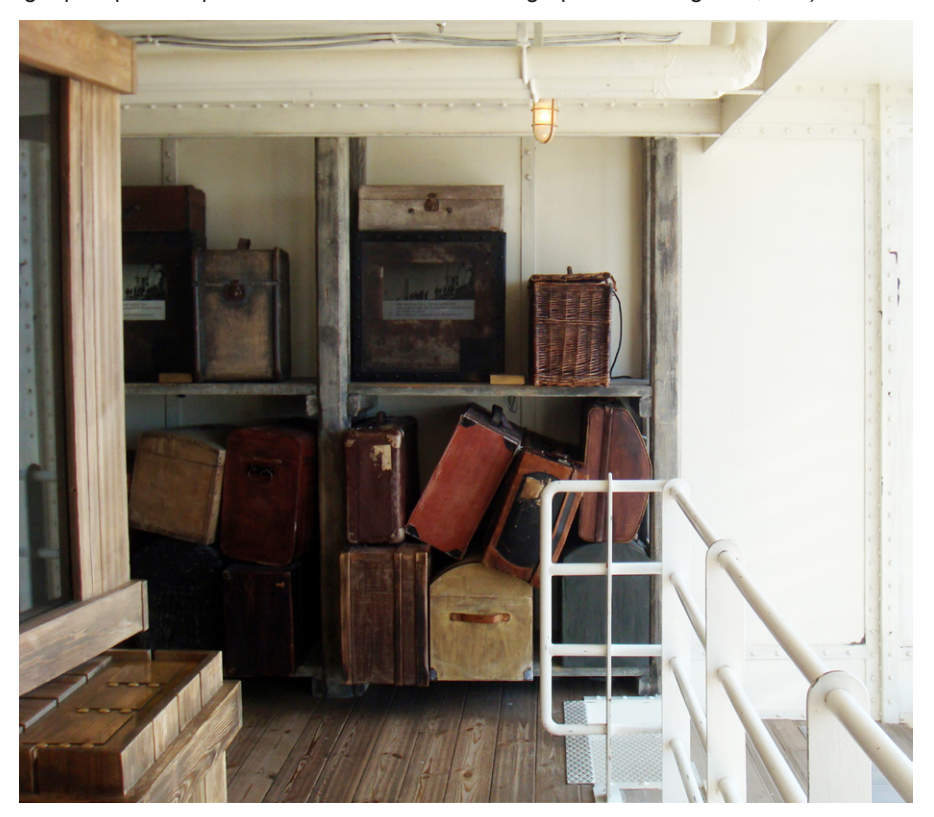
Figure 1: German Emigration Centre

These objects are largely present in exhibitions about emigration where they are often presented through some recurring mise-en-scène . Commonly, they are displayed in accumulation as the piles of luggage in the Bremerhaven Museum or those in the Ballinstadt Emigration Museum in Hamburg. In some cases they become themselves part of the display apparatus, serving as showcases containing several objects, pictures, videos and other media, such as in the exhibition Diàlegs Migrants at the Museum of the History of Immigration in Catalonia in Barcelona (17 May – 23 July 2013), where suitcases were used as display cases containing images and video-interviews. Another interesting example is represented by the exhibition Jeder ist ein Fremder – fast überall (2003–2007), a three-year-long travelling exhibition on European migration over time, where showcases were designed in a metaphorical and practical way as trunks: self-bearing elements containing several objects, pictures, videos and other media. In other cases, these objects are used as digital or analogical interactive devices serving as entry points to additional contents via visitors' interaction (e.g. browsing letters and accessing more details about the author's story, touching the replica of a toy to listen to its owner's vicissitudes, using a passport shaped device to discover real biographies of emigrants, etc.).