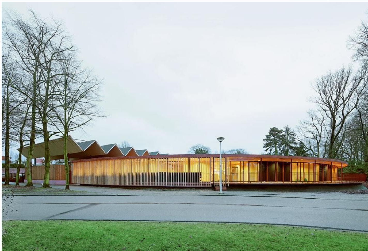
The north front with access to the kindergarten

The pairings proposed by 51N4E display sound judgement and absolute realism—their architecture simply observes and welcomes a complexity that already exists in everyday life