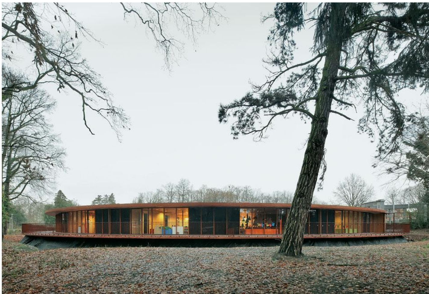
The south facade overlooking the garden