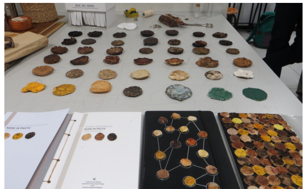
Figure 1. DIY Materials Course at Politecnico di Milano

We observed that through this kind of perpetual tinkering the students started to establish an emotional bonding with the materials they self-produced (Rognoli et al. 2016).