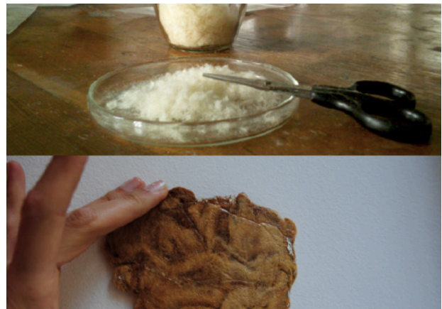
Figure 4. Cutting and arranging wool fibers

The second phase of experimentation ends with a series of iterations and creation of samples made adding and subtracting wool fibers to the mix of glycerol and starch and cooking them in a conventional oven. By analyzing the different samples, the first classification of possible material directions for further development started to arise (figure 5).