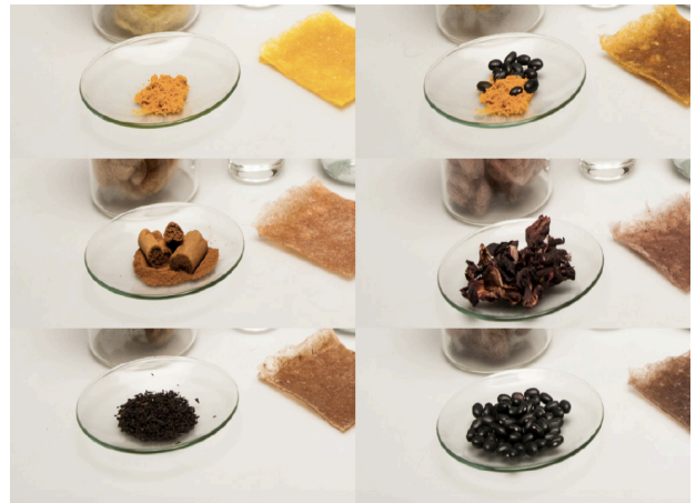
Figure 7. samples dyed with turmeric, cardamom, karkadè and black beans

As designers it was merely impossible to stop there: soon another experimentation phase was developed. We started the experimentation on how to process the material to obtain different shapes. In addition, all the tools needed for that phase were developed as DIY tooling. At the end of the process, two simple shapes were created with the material (figure 9) and a complete new path of experimentation by trial and error of possible shapes became visible.