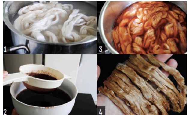
Figure 3. Cooking wool with different pigments

The second phase of experimentation ends with a series of iterations and creation of samples made adding and subtracting wool fibers to the mix of glycerol and starch and cooking them in a conventional oven. By analyzing the different samples, the first classification of possible material directions for further development started to arise (figure 5).