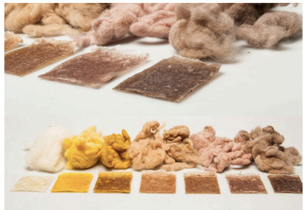
Figure 8. The Material Collection

As designers it was merely impossible to stop there: soon another experimentation phase was developed. We started the experimentation on how to process the material to obtain different shapes. In addition, all the tools needed for that phase were developed as DIY tooling. At the end of the process, two simple shapes were created with the material (figure 9) and a complete new path of experimentation by trial and error of possible shapes became visible.