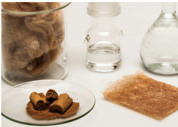
Figure 6. Material dyed with cinnamon

The third iteration phase begins with dyeing selected samples with natural pigments once again. This time natural pigments coming from spices were used. Figure 6 show the sample dyed with cinnamon. Figure 7 illustrates the results obtained by using turmeric, cardamom, karkadè and black beans. During the same iteration phase we tried to mix the spices in different quantities in order to obtain shades of different colors. Once this phase was over and a second selection of samples were defined, the New wool collection was born (figure 8). A self-produced, low-tech and easily replicable materials.