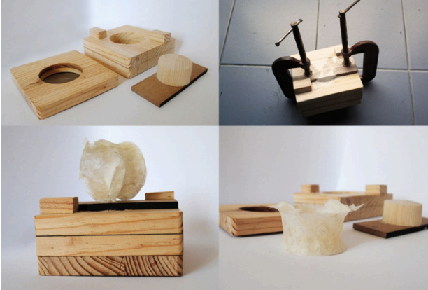
Figure 9. Do-It-Yourself Tooling and shapes obtained

Furthermore, the research suggests to focus on the sensorial qualities and experiential patterns of the materials developed in order to obtain different and meaningful materials experiences. For that reason, a full course on the matter was created and is taking place on a regular basis at the Politecnico di Milano.